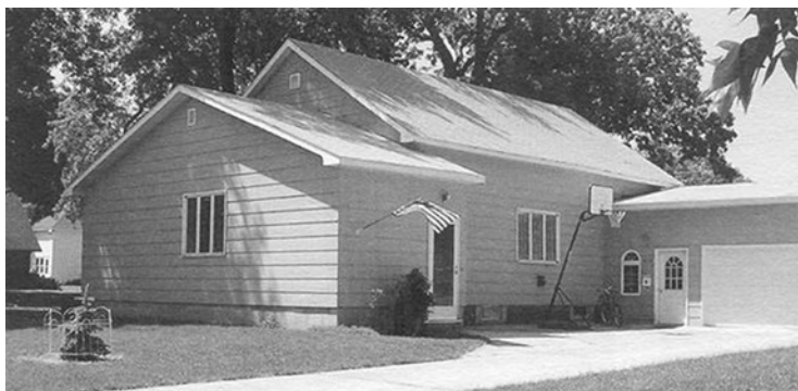
Harker family residence.