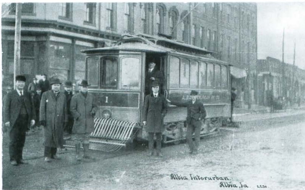
The Albia Interurban in front of the bank a century ago.