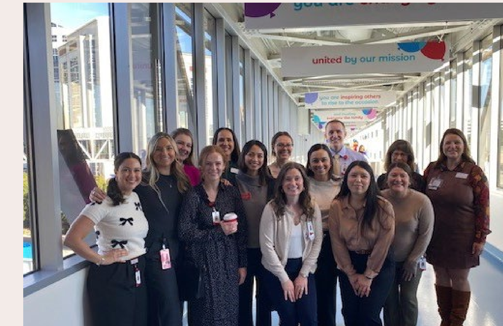
TTUHSC PNP Faculty & Students Annual visit to CHST

These efforts position the organization as a preferred practice environment for future nurses.