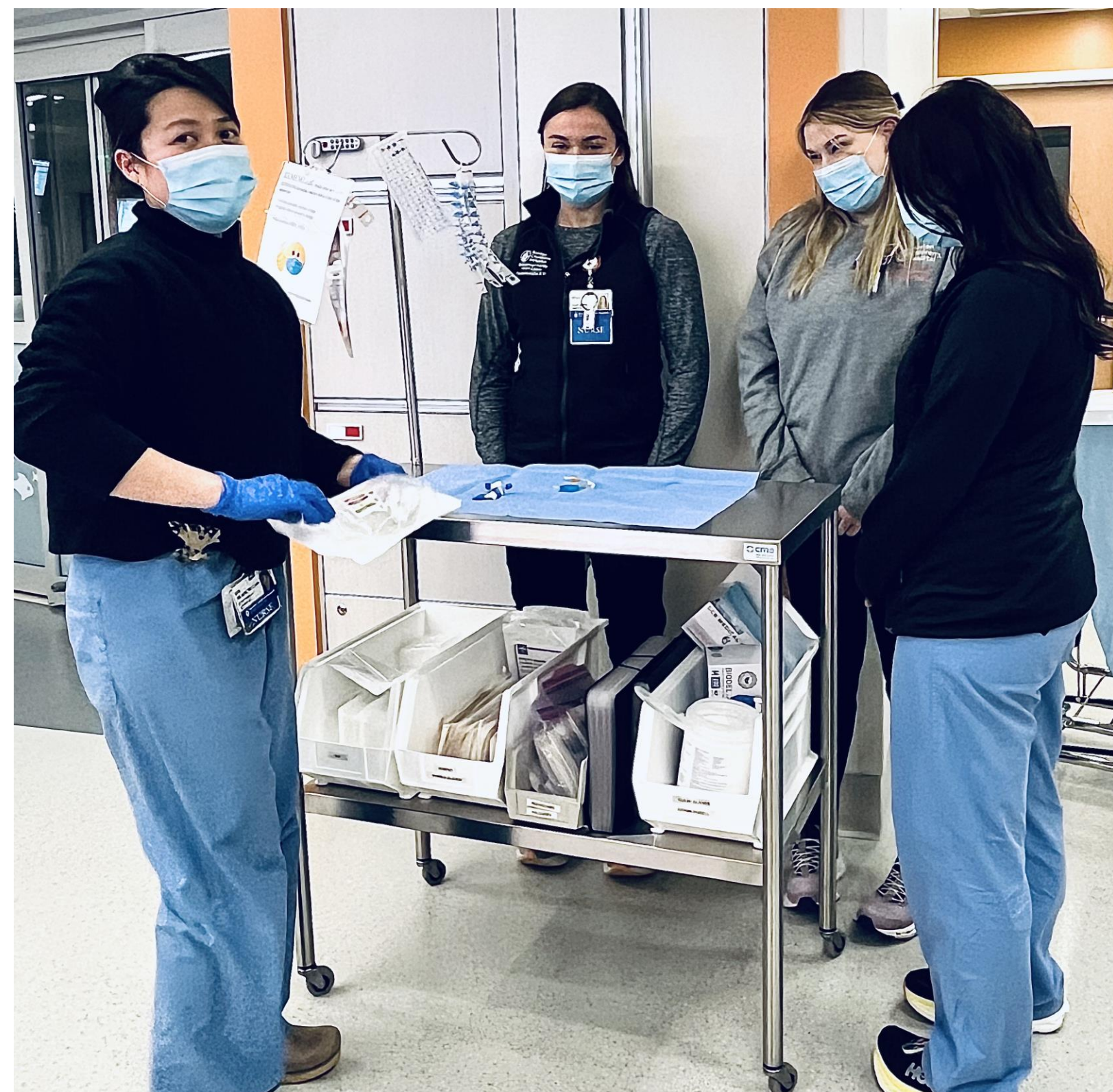
Figure 2: Sterile IV Infusion Preparation