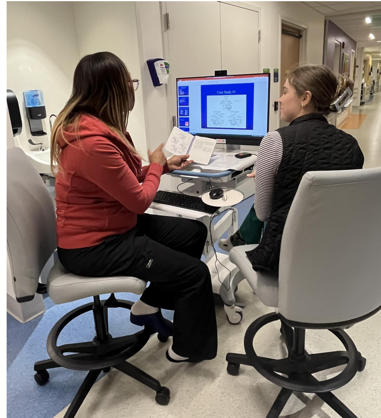
Figure 1: Review of Anatomy and Physiology