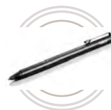
ThinkPad® Pen Pro 4X80H34887