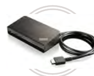
ThinkPad® OneLink+ Dock 40A40090US