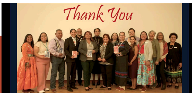
Awardees with Board Members and NPAC staff

On October 18, 2024, the Native Professional Advancement Center hosted the Clyde Warrior Civil Rights Recognition event to celebrate the Red Power roots that run deep from the organization's parent company, the National Indian Youth Council (NIYC). Clyde Warrior was an icon of the Red Power Movement in the 1960's that fought to recognize the human and civil rights of American Indians. Organized in partnership with the American Indians for Opportunity (AIO) and the Native Leadership Collective, the event recognize community leaders and organizations who have worked to promote the civil rights of Native Americans.