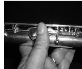
Photo of Thumb Bb Position