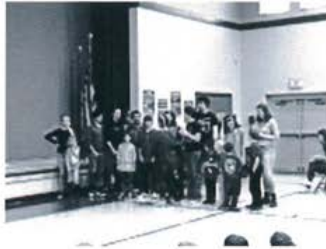
High School Without A Cue