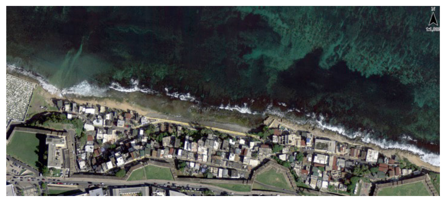
Figure 1: Aerial view of the community of La Perla.

absence of an objective or absolute bond." The only link between the inhabitants of collective housing is the roof that covers them, like buildings, and the land they walk. Contemporary cities are composed, well, block and neutral public spaces that could be anywhere.