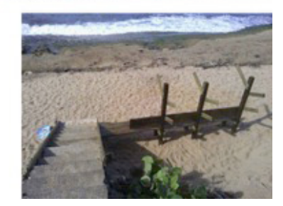
Figure 4: Vista Mar's Clubhouse. Figure 5: Luigi's Stair

Insert Paper Title Here Session Title Cross-Americas: Probing Disglobal Networks