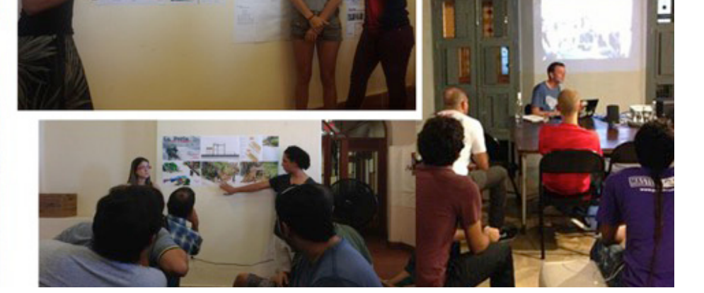
Figure 3: Reviews and Presentations

and turned into a playground together with the children from the sector; nickname los gallitos (Figure 4). The steps, contiguous the community center, were rehabilitated as colorful stands to see the spectacle of the sea. Lastly, Luigi's Stair in the sector of waipao, is an intervention that the students built on the beach. They completed a deteriorated stair to recuperate the access to the water (Figure 5). The project that included the help of local surfers still holds its presence at the beach. The stair-sitting bench has become a meeting space and the threshold for locals to become one with the waves.