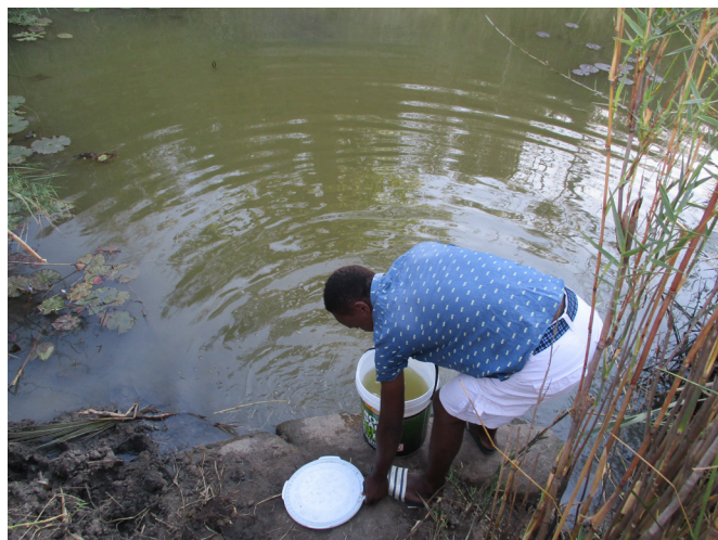
Figure 2 A man fetches water at the river for household use. Community stakeholder description: this picture illustrates the circumstances that people face every day. Despite the risks of using dirty water, people are left with no option but to use dirty water to which they have access.

5). Serious economic impacts were also acknowledged. Buying water from tanker drivers is unaffordable in areas of high unemployment and welfare dependence: 'our finances are also affected because we use our money to buy water... we should use that money to buy other things' (WRA, workshop 2). Life was described as an ongoing struggle without water especially for vulnerable community members: 'I am unable to push the wheelbarrow [disabled participant with one hand]. I am unable to carry the bucket of water on my head. I wish I could have a tap in my house... it will make my life easier' (family member, workshop 2).