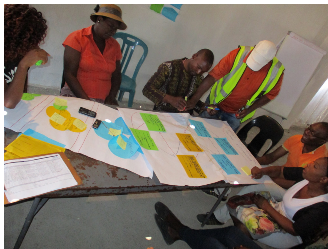
Figure 8 Development of action pathways based on workshop outputs detailing: problems, causes, impacts, actors and institutions.

in all meetings; there were no drop outs other than one participant who relocated to Johannesburg.