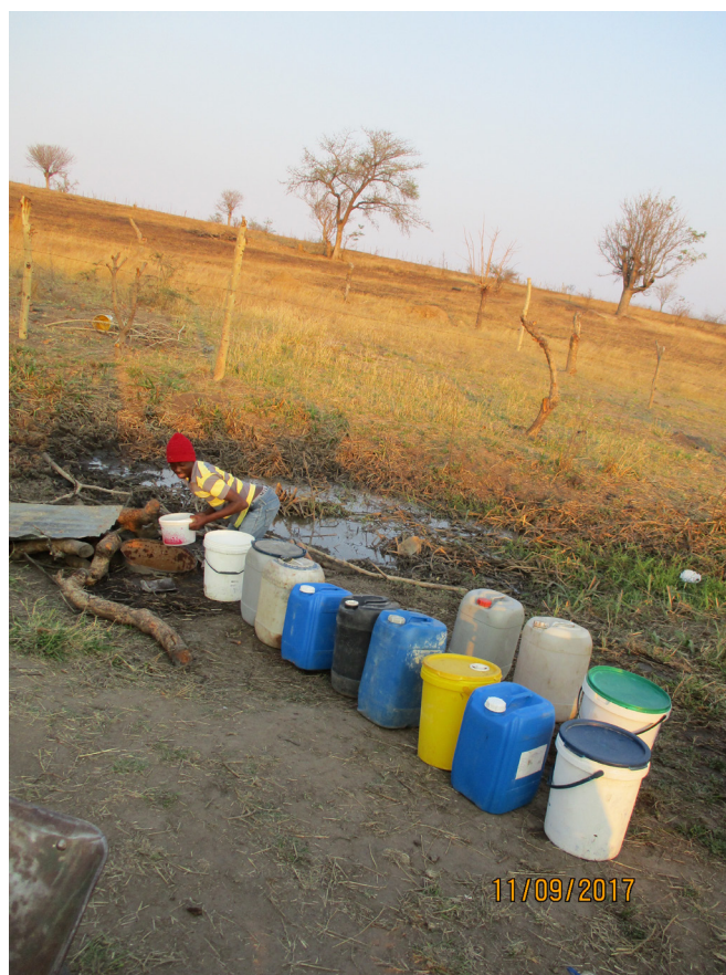
Figure 5 Female community member fetching water alongside a string of water containers. Community stakeholder description: the containers are left in the queue to be filled when the water returns. People spend large amounts of time waiting for water at unreliable sources.

amounts of time were described walking long distances to collect and carry water. It was also reported that water is often only available for collection at night and early