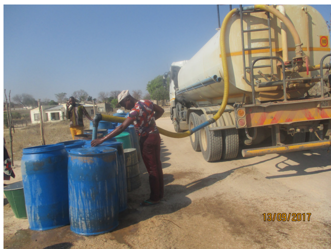
Figure 3 A tanker that supplies villages with water due to intermittent supply. Community stakeholder description: the community see this as an impediment to provision of domestic taps, deterring attention from efforts to improve the water situation. Furthermore, mobile tankers are not always available due to lack of fuel and are alleged to deliver contaminated water.

The burden of collecting water was documented as primarily borne by women and children. Significant