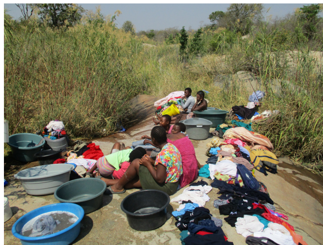
Figure 4 Women accompanied by children doing laundry by the river. Community stakeholder description: laundry is done on 'washing rocks' or in dishes because there is no running water in the communal taps. Doing laundry by the river saves carrying water to households.

amounts of time were described walking long distances to collect and carry water. It was also reported that water is often only available for collection at night and early