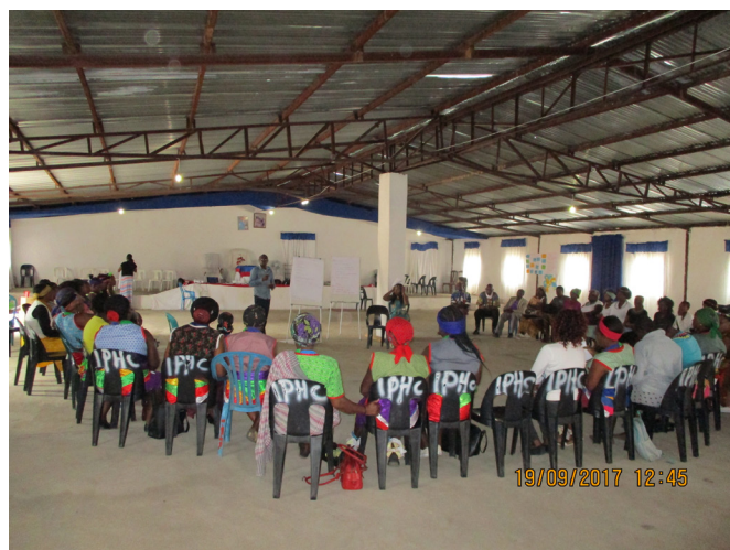
Figure 7 Participants from all villages convene to discuss and build consensus on nominated topics in session cofacilitated by community stakeholders.

The process created spaces for colearning, understanding others and facilitated new linkages. Participants were oriented to consensus-building techniques, which enhanced team work, took active roles during the weekly workshops, were keen to learn new skills and were generally enthusiastic about the approach (figures 7–8). Participants reported feeling valued and respected when they recognised that their contributions, voices and ideas were captured: 'we are happy because our views were considered' (family member, workshop 8). Attendance was high