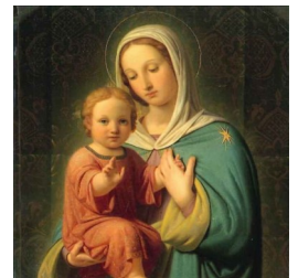
MARY: God's Yes to Man John Paul II's Encyclical Redemptoris Mater Introduction by Joseph Cardinal Ratzinger Commentary by Hans Urs von Balthasar IGNATIUS

Pope John Paul II's only encyclical on our Blessed Mother, with introduction by the Cardinal Prefect of the congregation for the Doctrine of the Faith, Cardinal Joseph Ratzinger, and commentary by one of the world's leading Catholic theologians, Hans Urs von Balthasar. The Church's supreme magisterium and representative of the Church's most penetrating theological reflection combine to provide for all the faithful a rich and concise compendium of the Mother of the Redeemer.