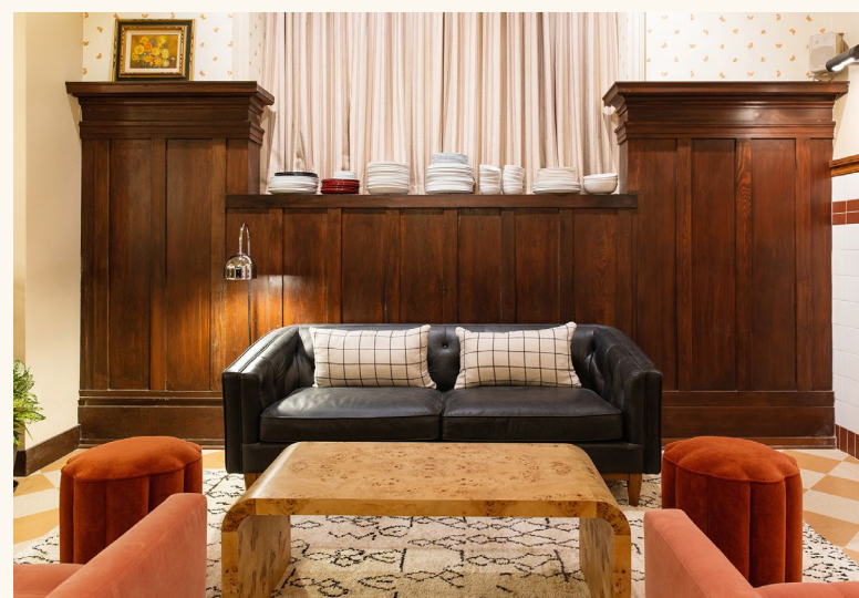
Private Event Space