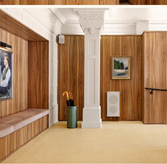
Exterior, Lobby and Front Desk