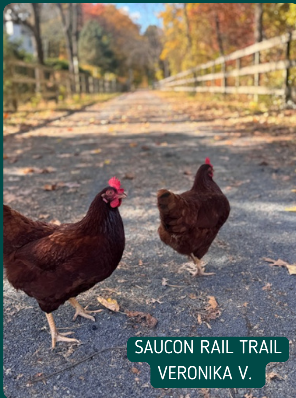
SAUCON RAIL TRAIL VERONIKA V.