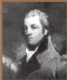
Charles Lennex, 4 th Duke of Richmond