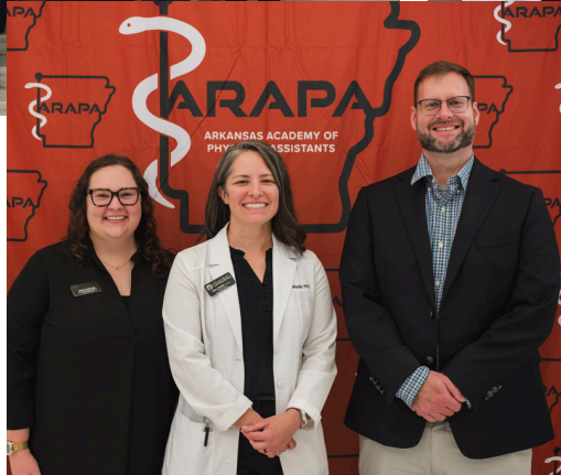
Right: UAMS PA students