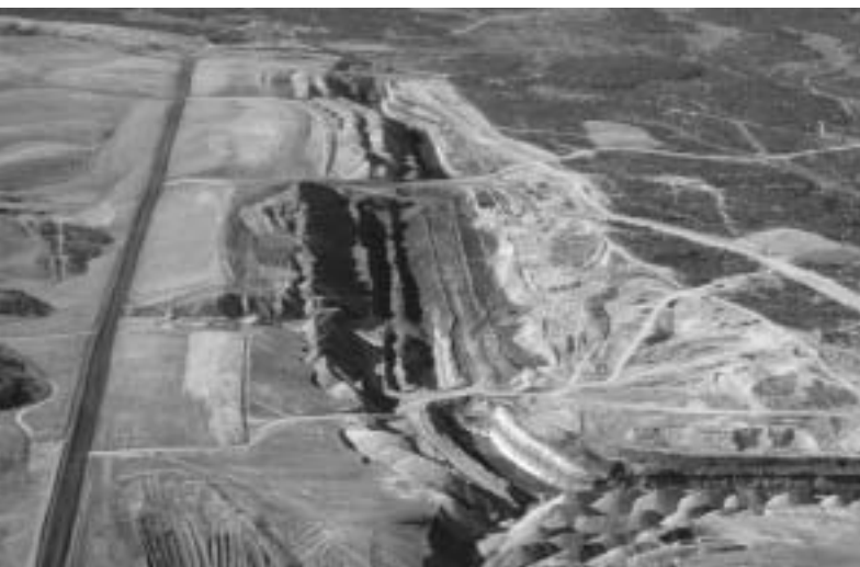
Left: Since 1970, Peabody Energy’s coal mine on the Hopi reservation has withdrawn 40 billion gallons of water from the Navajo Aquifer – enough to sustain the entire Hopi tribe for more than 350 years.

In 2000, The Natural Resources Defense Council reported aquifer water levels down by more than 100 feet in some wells. Hydrologists predict that within