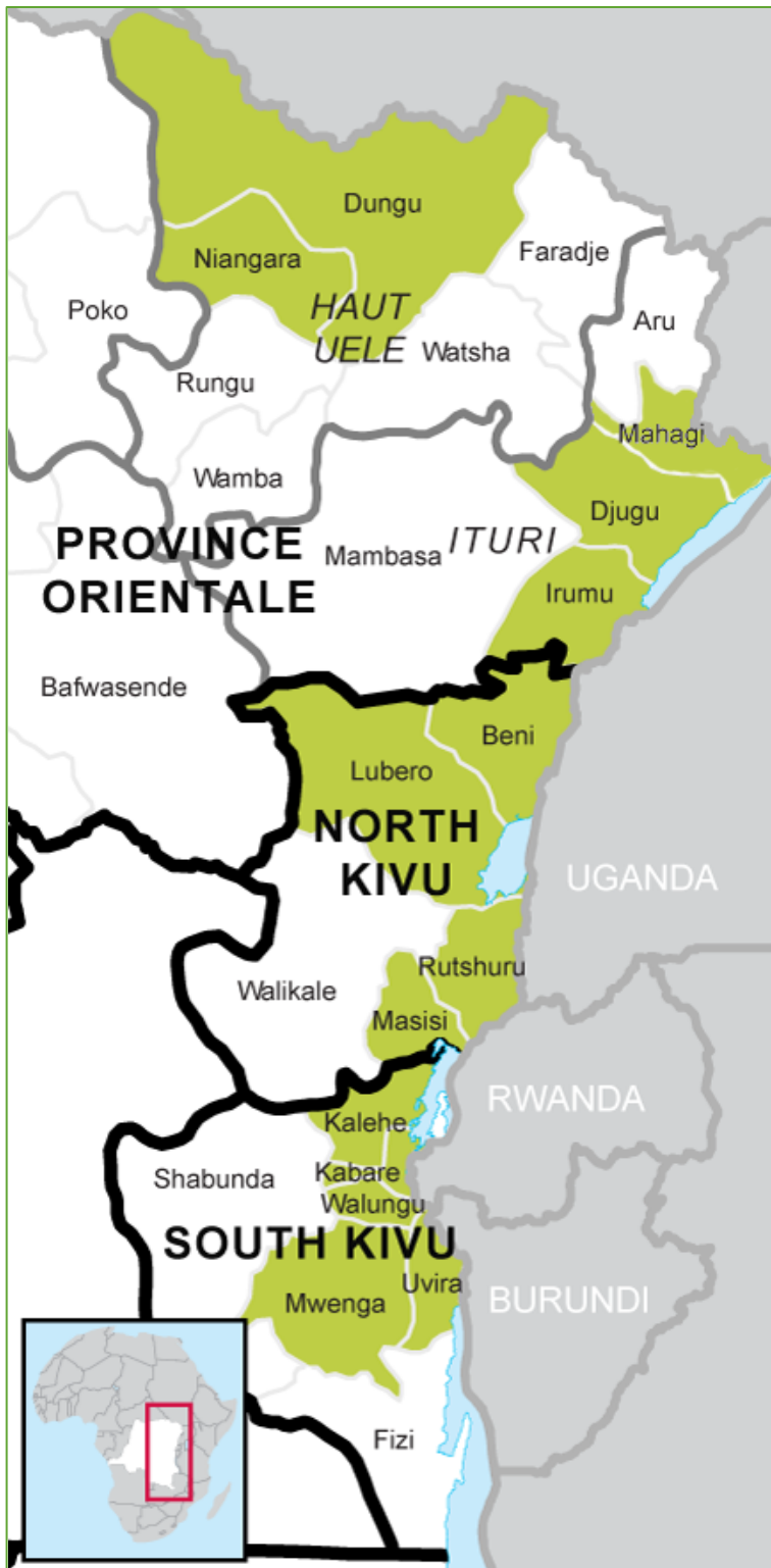
Map of eastern DRC showing the areas in which Oxfam's 2012 protection assessment was carried out