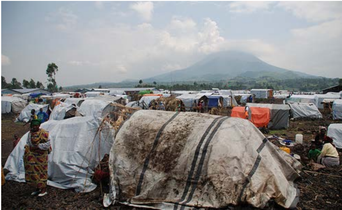
Kanyaruchinya IDP site, north of Goma (North Kivu, DRC), September 2012.