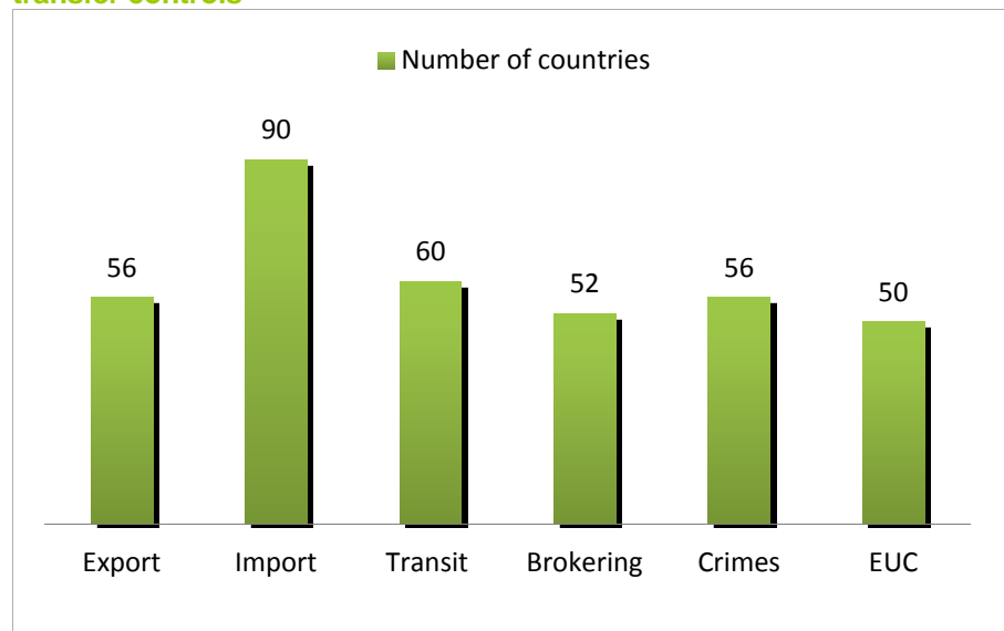
Figure 3: Number of countries reporting key types of international arms transfer controls

As evidence in the example at the end of the preceding section regarding Slobodan Tescic, foreign countries can sometimes identify whether a particular arms transfer has the potential to be diverted to an unintended end-user by evaluating the specifics of the transfer. In the case in which Albanian arms went to Libya, the transfer of such a large quantity of mortars to a rather small population should have raised some suspicion among Albanian government officials, as well as the fact that Tescic was involved in the deal. An estimated 150 countries, however, did not officially make such a risk assessment, as of 2006. 77