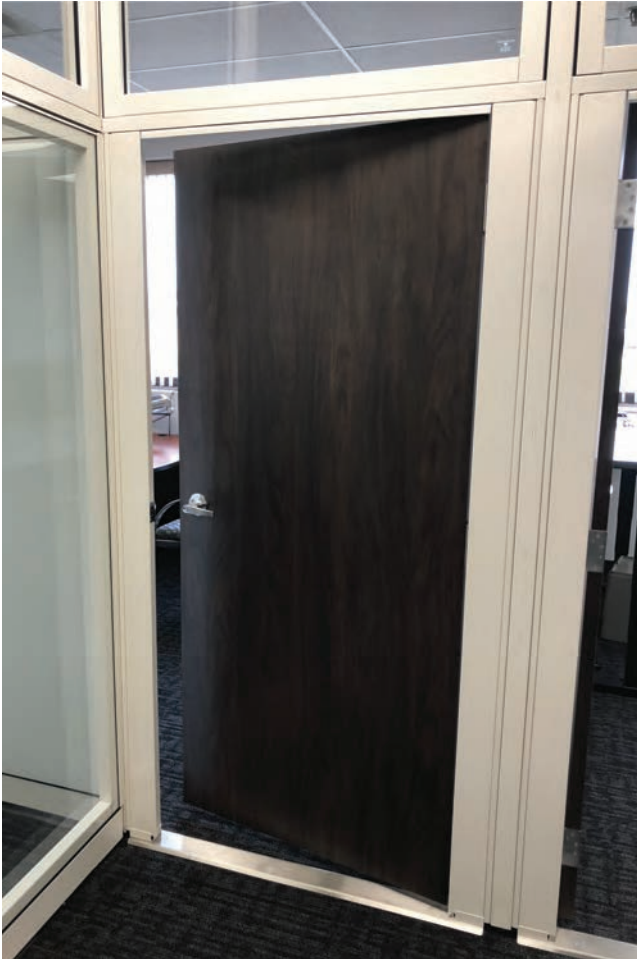
Door handing guide