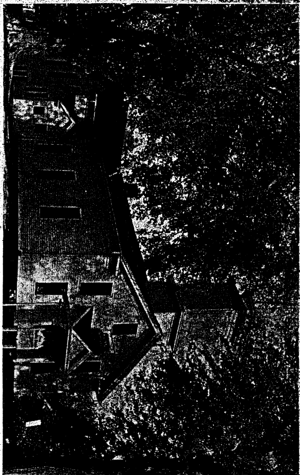
Avon Baptist Church, Stoney Ridge Rd. Also one of the city's oldest churches.