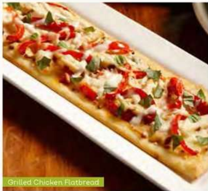
Grilled Chicken Flatbread