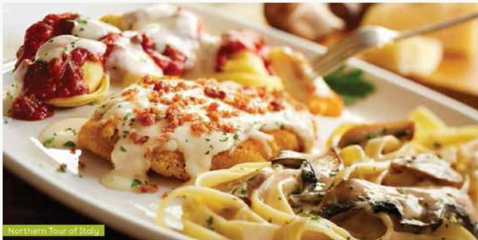
Northern Tour of Italy