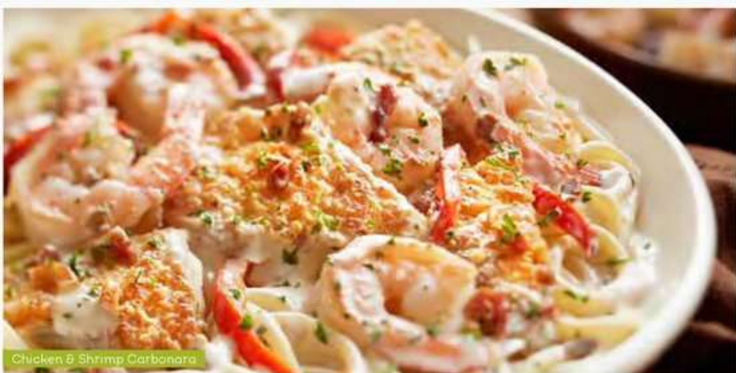
Chicken & Shrimp Carbonara