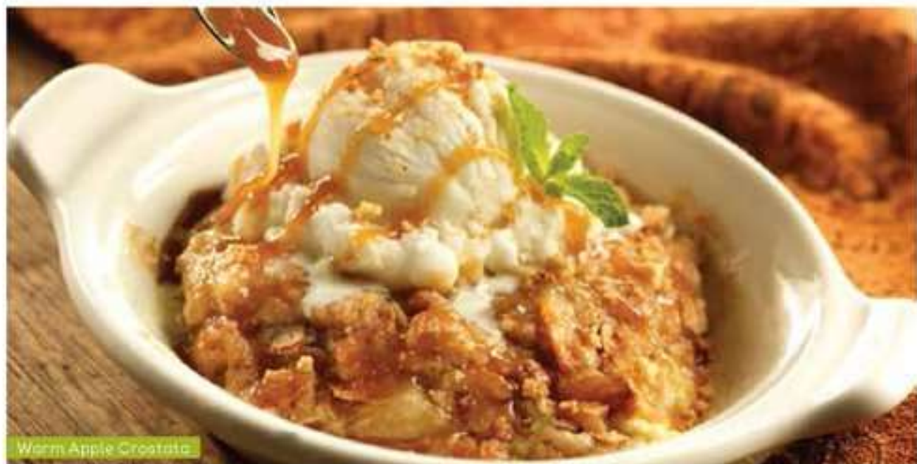
Warm Apple Crostata