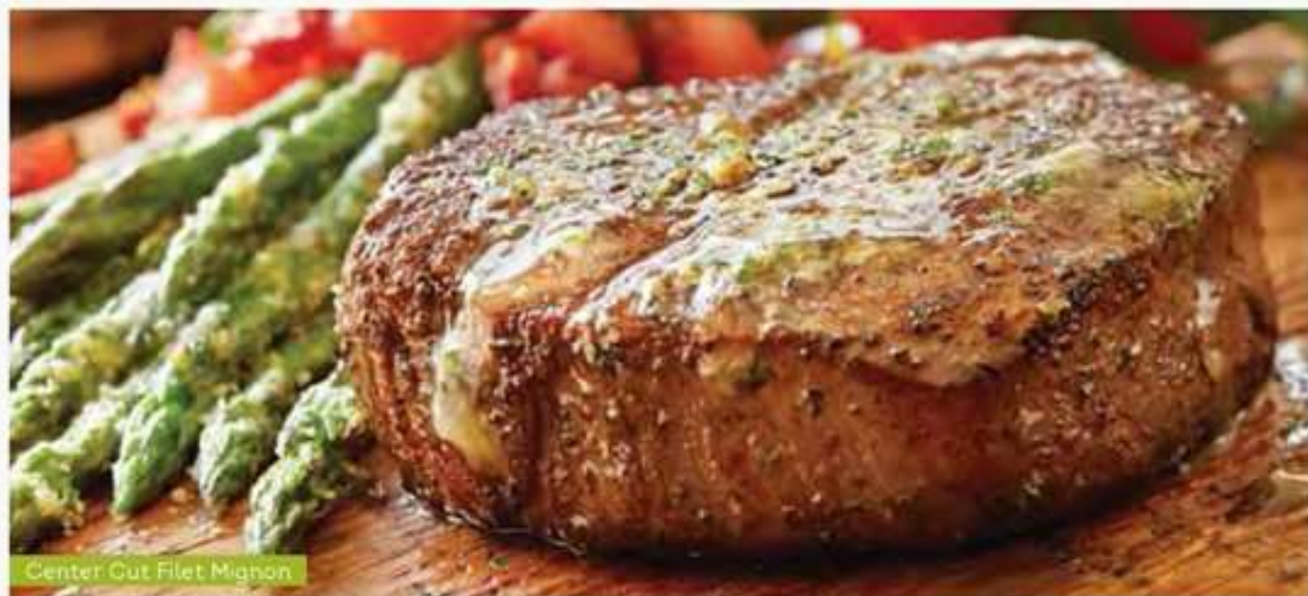
Center Cut Filet Mignon