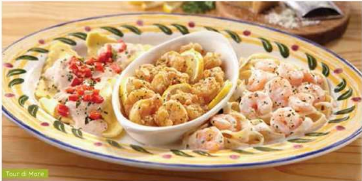
Tour di Mare