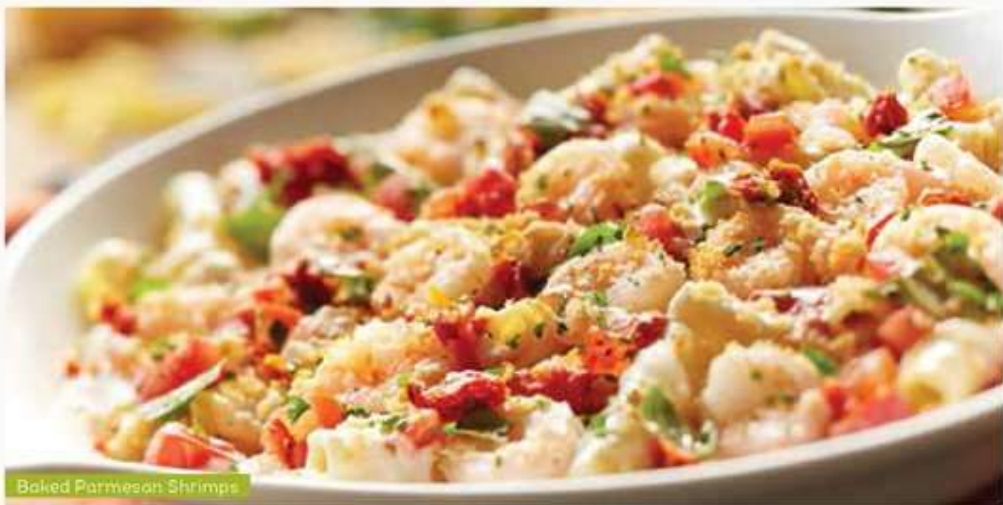
Baked Parmesan Shrimps