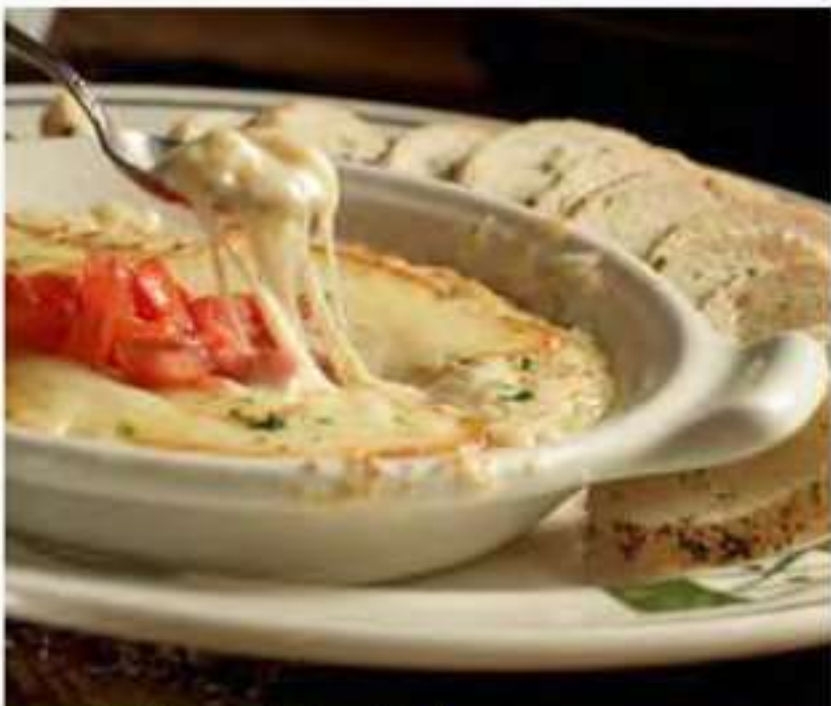
Smoked Mozzarella Fonduta