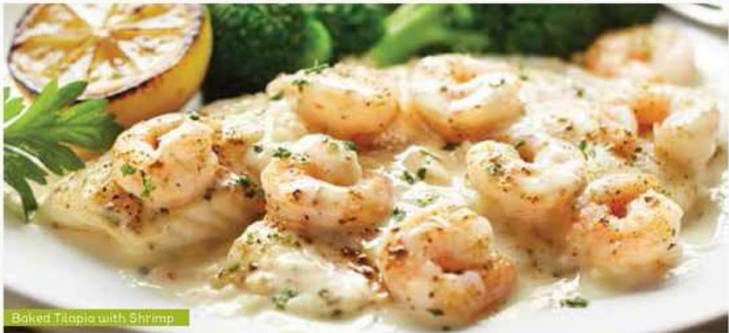
Baked Tilapia with Shrimp

Creamy shrimp Alfredo, lightly fried shrimp scampi frita and ravioli filled with shrimp and crab. AED 89