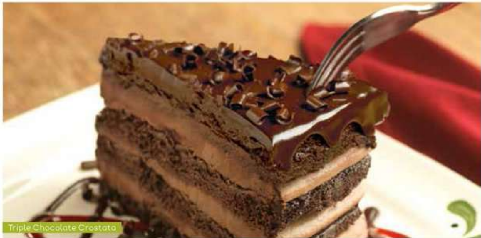
Triple Chocolate Crostata