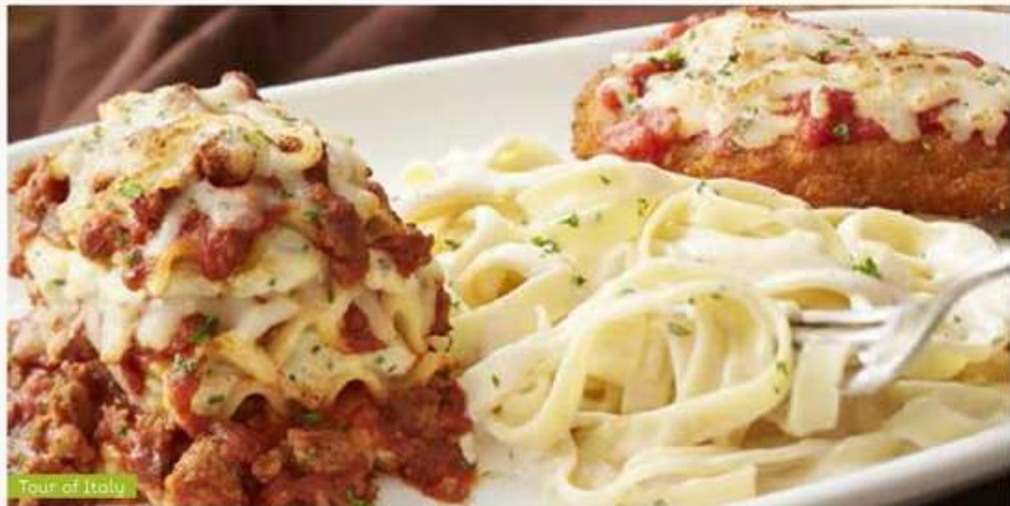
Tour of Italy