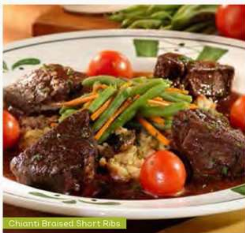
Chianti Braised Short Ribs

Grilled beef medallions drizzled with balsamic glaze, served over fettuccine tossed in spinach and gorgonzola-Alfredo sauce. Steak prepared medium unless otherwise requested. AED 99