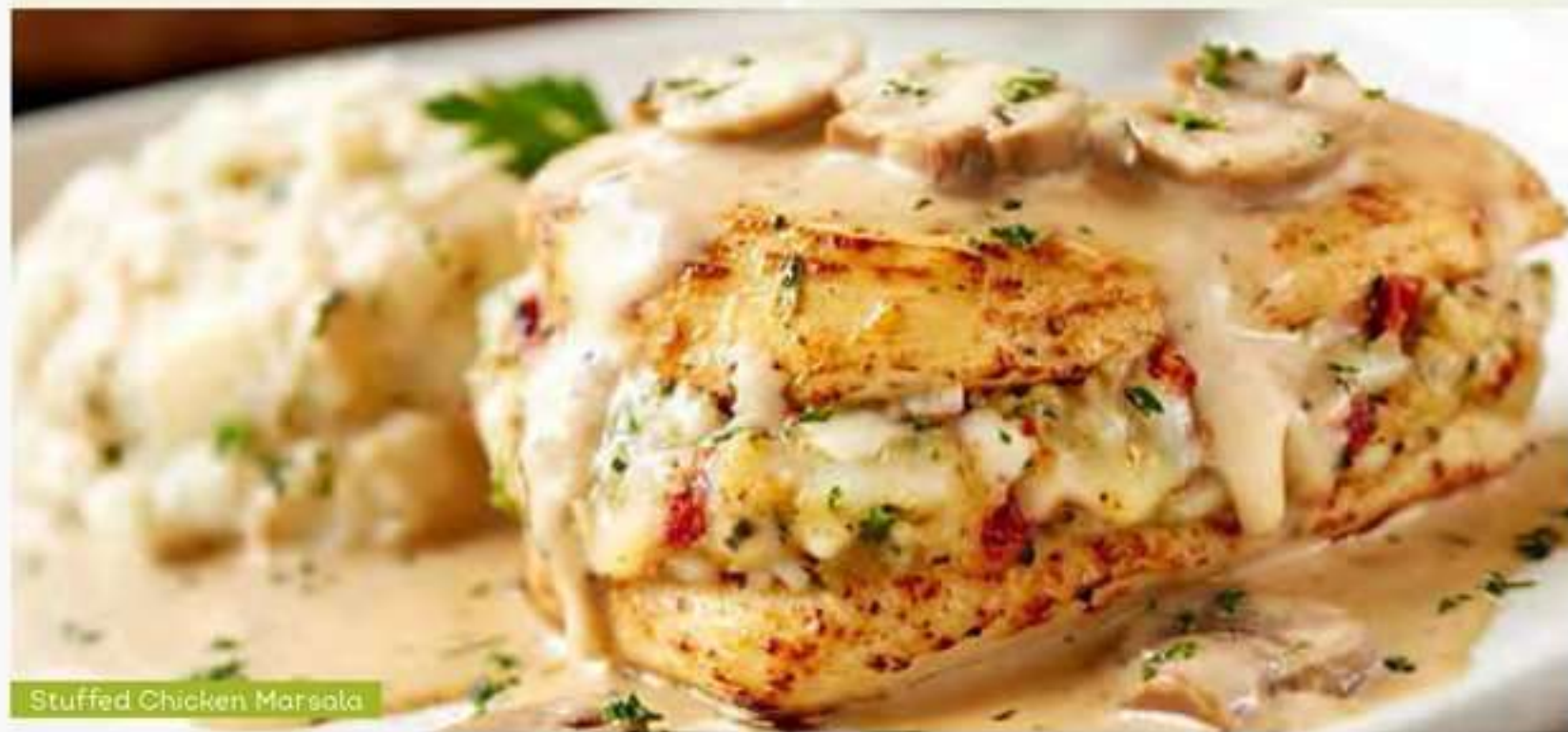
Stuffed Chicken Marsala

Oven-roasted chicken breast stuffed with Italian cheeses and sundried tomatoes, topped with mushrooms and a creamy Marsala sauce. Served with garlic Parmesan mashed potatoes. AED 75