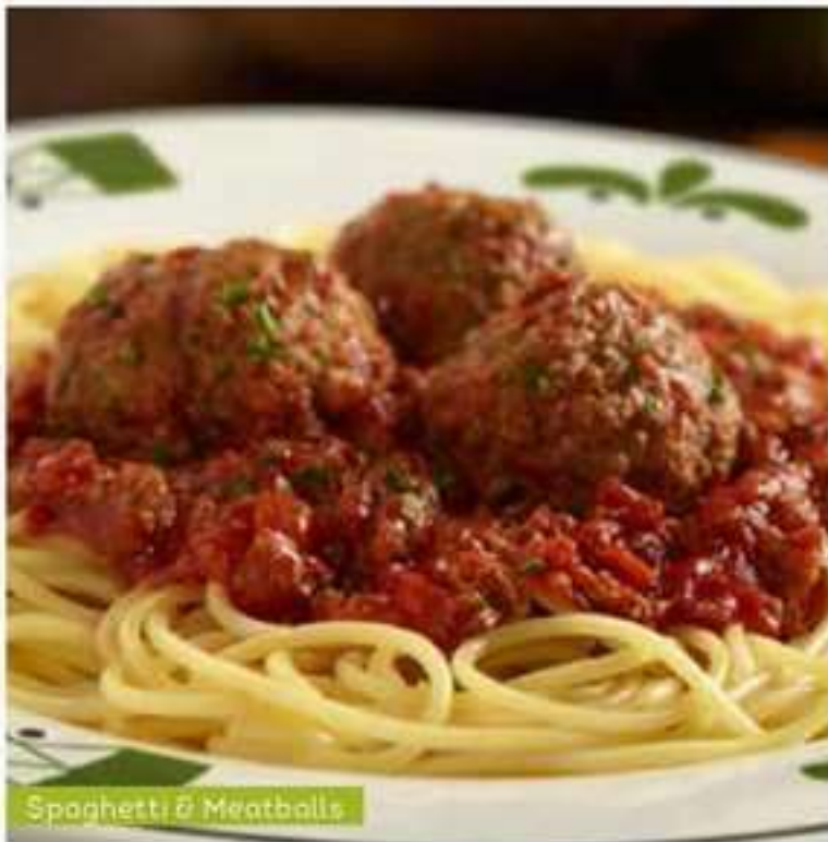
Spaghetti & Meatballs