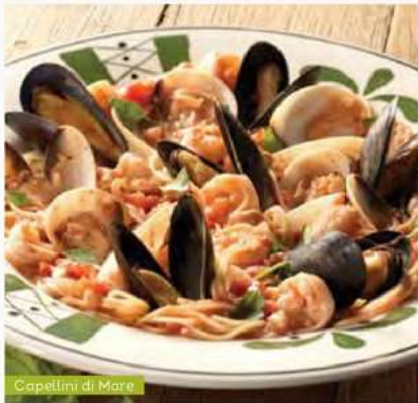
Capellini di Mare