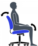
Chair Tilt Lock