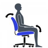
Chair Tilt Lock