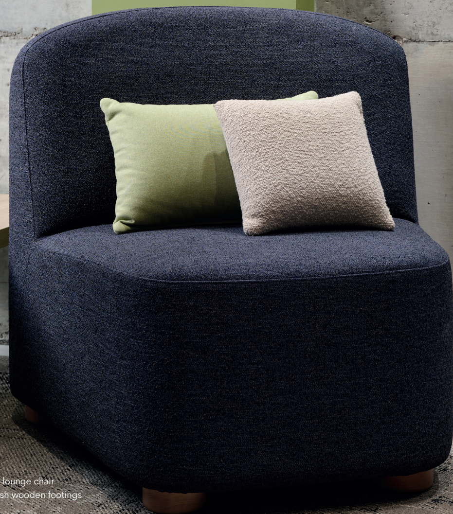
Furniture Iris angular lounge chair Natural finish wooden footings

In a world where work environments are constantly evolving, Iris stands out as an elegant and versatile solution for designing collaborative spaces, waiting areas, and videoconferencing rooms.