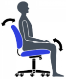
Chair Tilt Lock