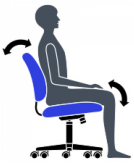
Chair Tilt Lock