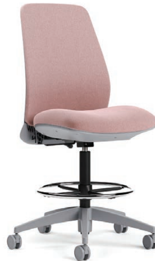
Armless upholstered back height adjustable stool, task basic swivel