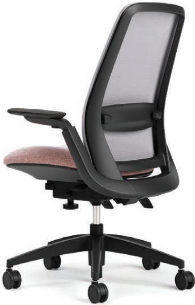
Black frame and base