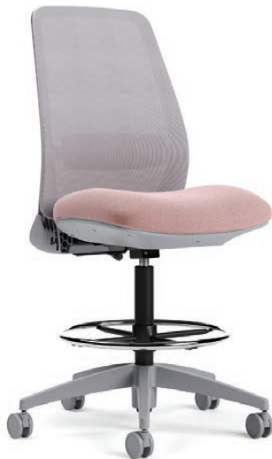
Armless mesh back height adjustable stool, task basic swivel