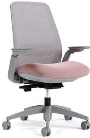
Mesh back chair, weight sensing synchro-tilter