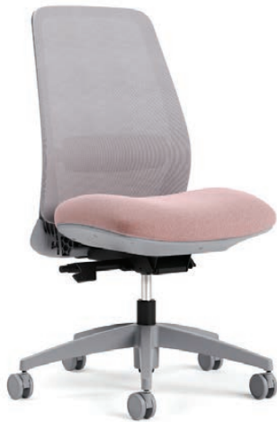
Armless mesh back chair, weight sensing synchro-tilter