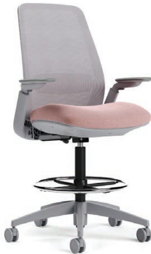
Mesh back height adjustable stool, task basic swivel