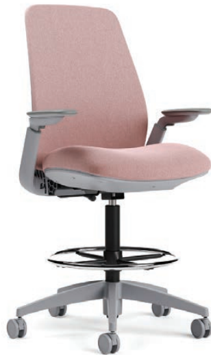
Upholstered back height adjustable stool, task basic swivel

Noetic offers a range of task chairs with three mechanisms, mesh or upholstered backs, and models with or without arms. Back height, seat depth and arm adjustment options support a range of body types and seating preferences.