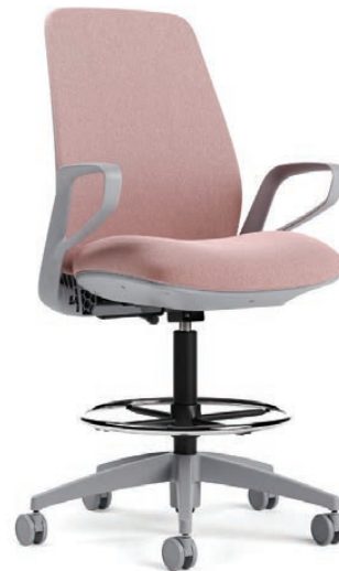
Upholstered back height adjustable stool, task basic swivel

Height adjustable stools support counter and bar height seating in education and workplace applications. Noetic is GREENGUARD Gold and BIFMA LEVEL 3 certified and is backed by Global's Limited Lifetime Warranty.