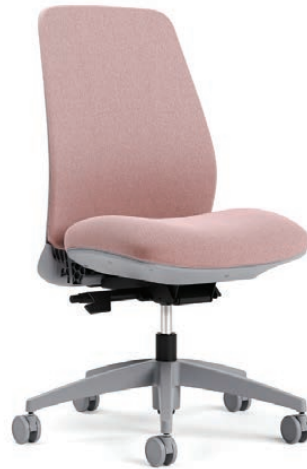
Armless upholstered back chair, weight sensing synchro-tilter