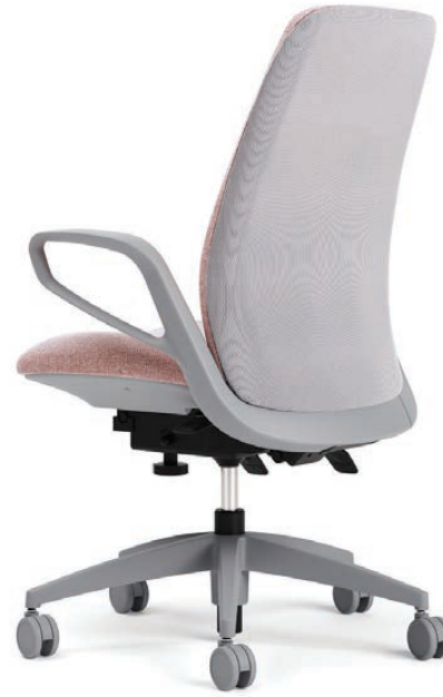
Fog frame and base with upholstered seat and back

Personalize your Noetic chair with a choice of ten Dimension Mesh and six Digital Mesh colors. Bring it all together with three frame finishes, matching arms and bases, and a comprehensive selection of Global Carded or Alliance Partner textiles.