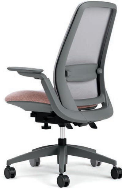
Shadow frame and base