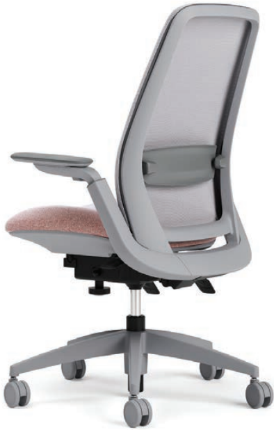
Fog frame and base