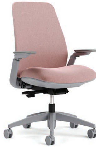
Upholstered back chair, weight sensing synchro-tilter