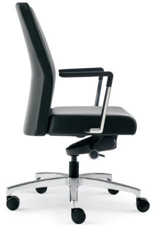
REQUISITE MIDBACK, 7-ARMS