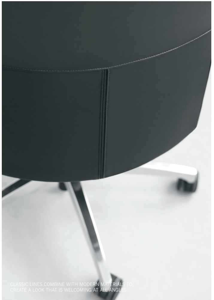
CLASSIC LINES COMBINE WITH MODERN MATERIALS TO CREATE A LOOK THAT IS WELCOMING AT ALL ANGLES.