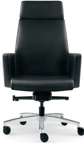
REQUISITE HIGHBACK, UPHOLSTERED ARMS