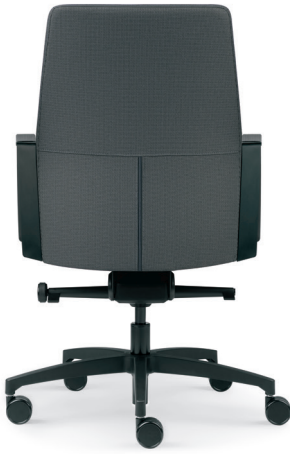
REQUISITE MIDBACK, LOOP ARMS

Design options include chrome or nylon frames, three arm styles, two back heights and two mechanisms in order to tailor Requisite to your specific needs.