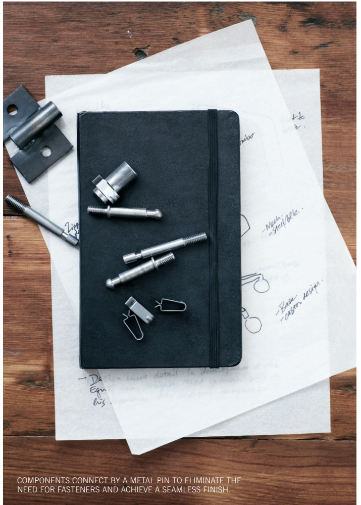
COMPONENTS CONNECT BY A METAL PIN TO ELIMINATE THE NEED FOR FASTENERS AND ACHIEVE A SEAMLESS FINISH.