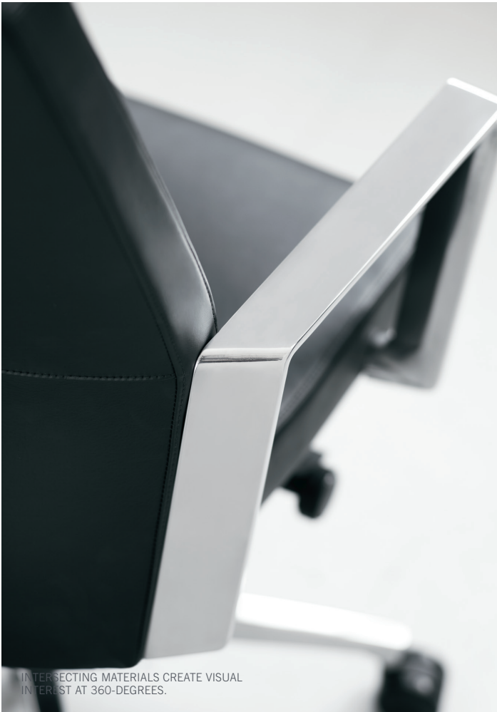
INTERSECTING MATERIALS CREATE VISUAL INTEREST AT 360-DEGREES.