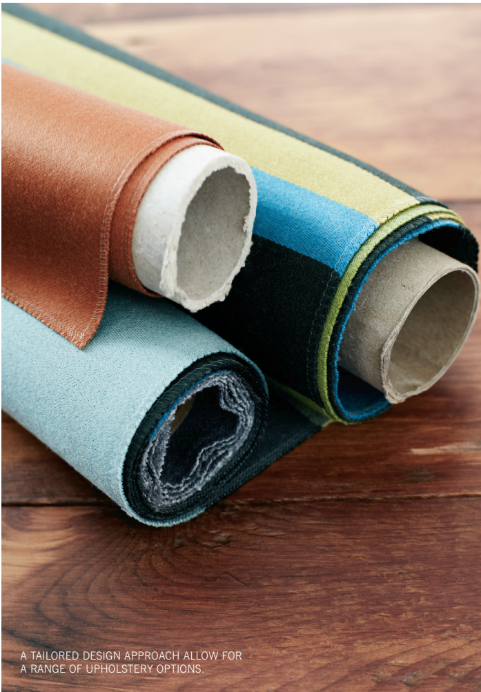
A TAILORED DESIGN APPROACH ALLOW FOR A RANGE OF UPHOLSTERY OPTIONS.