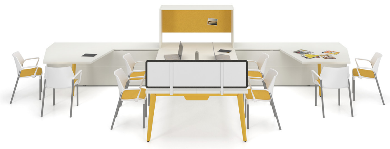
Creative C.I.T.É. configuration in Snow finish, with large felt screen and yellow Montreal metal legs. IO seating by United Chair.