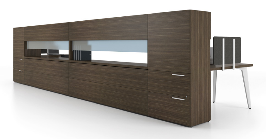
Sleek C.I.T.É. wall system in Grigio finish with translucent acrylic Sky accents, surface-mounted felt screen and optional white Montreal metal legs.

Interaction, conversation, creation: Groupe Lacasse developed the C.I.T.É. collection as an ever-evolving solution to your organization's multifaceted needs. Integrating a wide range of innovative details, thermofused materials of superior quality, and the latest technologies in the field, it has been designed to deliver more than 25 years of flexibility and functionality!