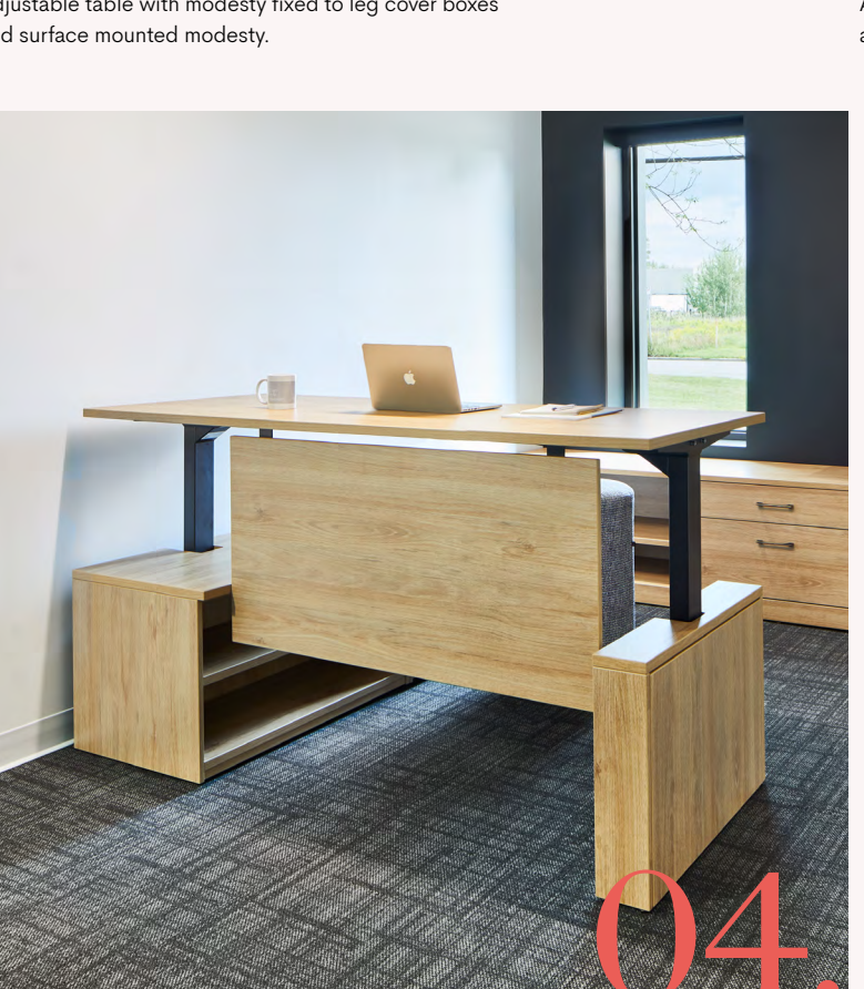
Adjustable table with bookcase type storage, built-in leg, surface mounted modesty and leg cover.