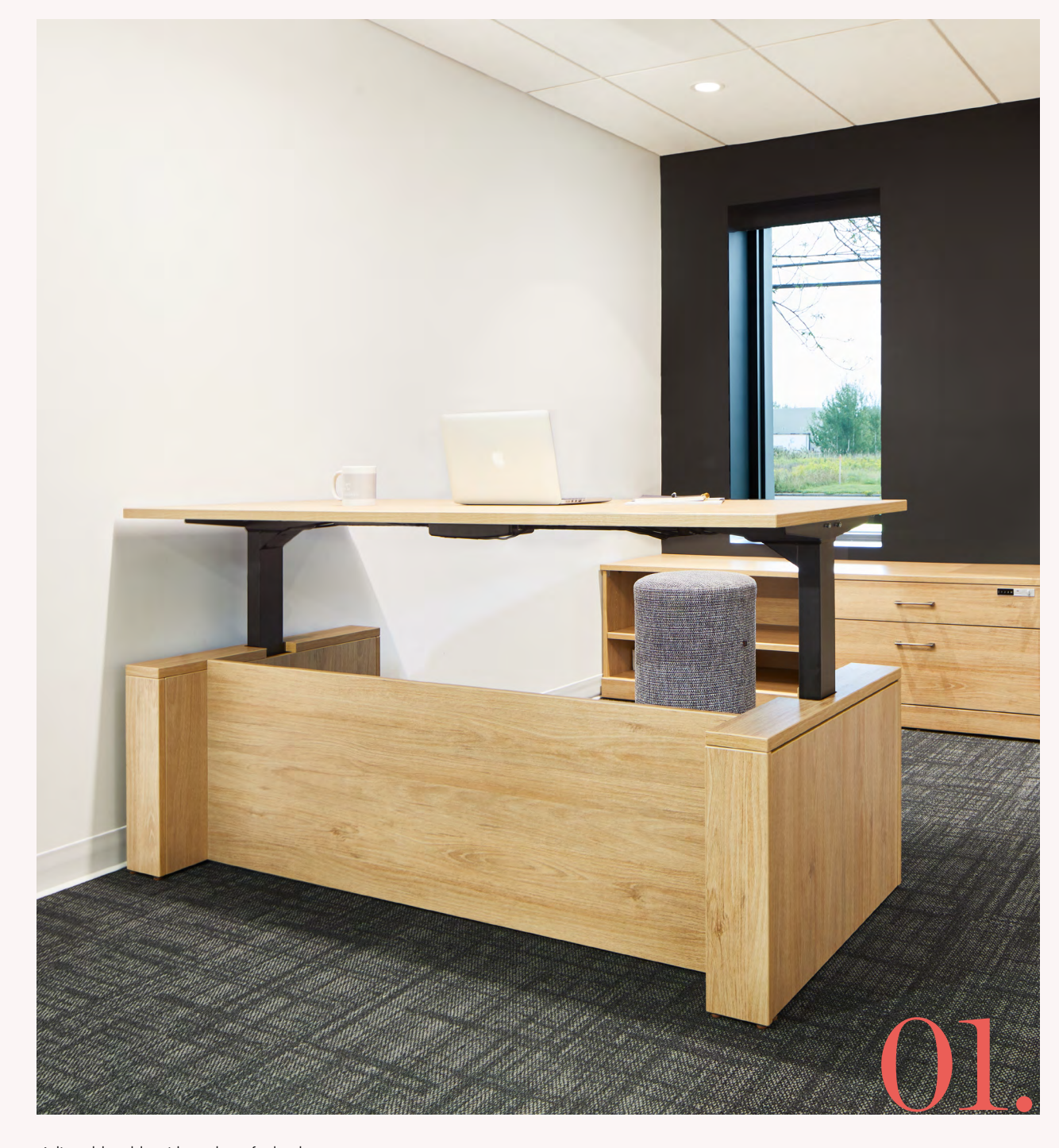
Adjustable table with modesty for leg boxes.