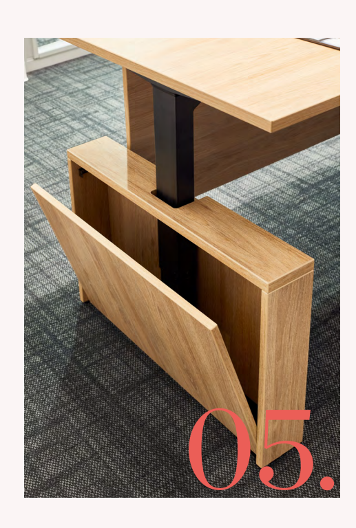
Leg cover with a removable door on the outside that allows an easy installation of the height adjustable table leg.