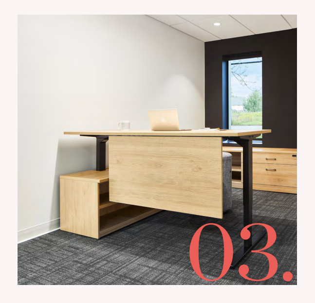
Adjustable table with bookcase type storage, built-in leg and surface mounted modesty.