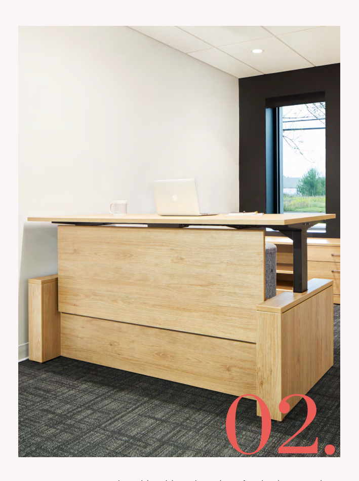
Adjustable table with modesty fixed to leg cover boxes and surface mounted modesty.