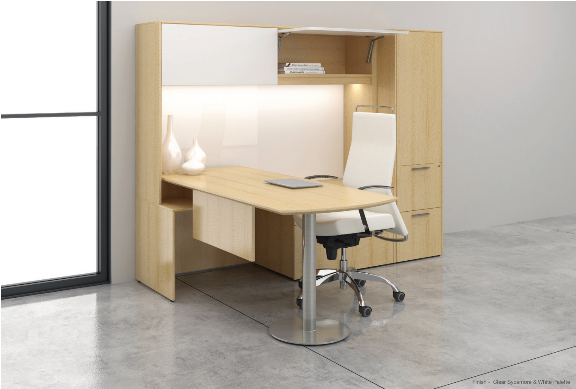
Finish - Clear Sycamore & White Palette