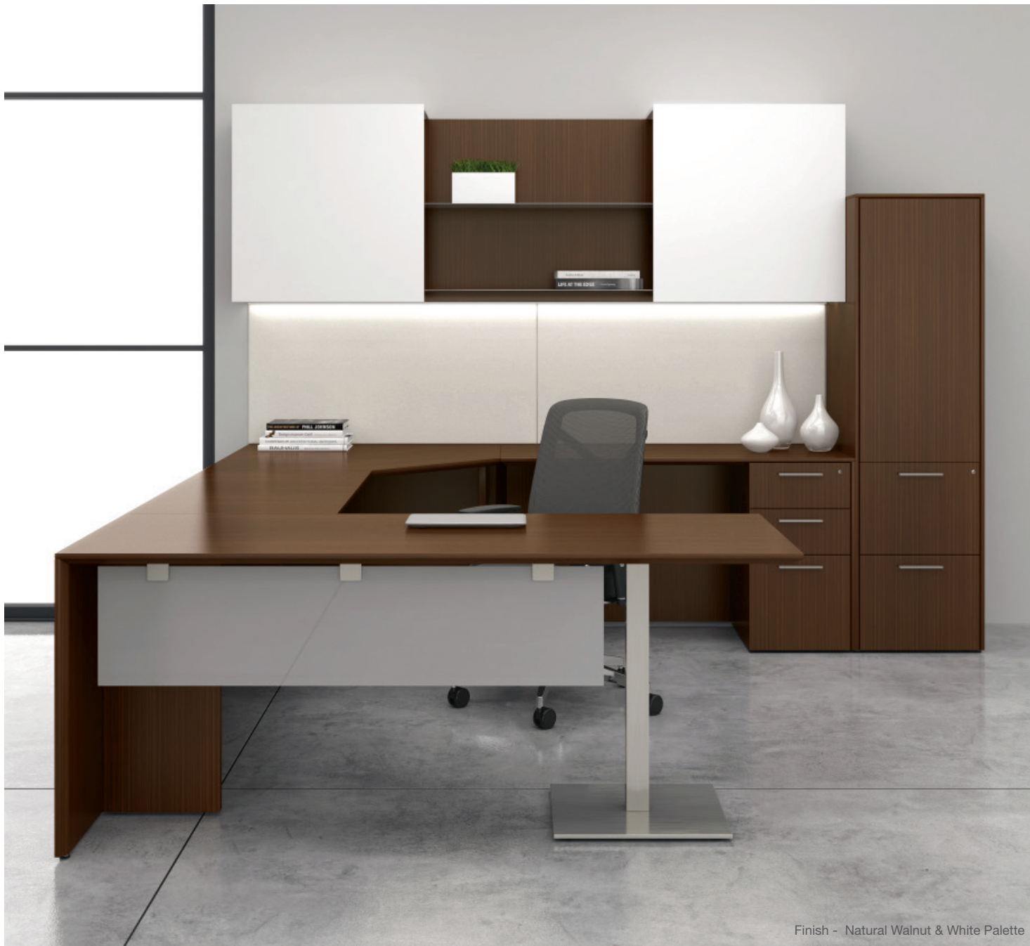
Finish - Natural Walnut & White Palette