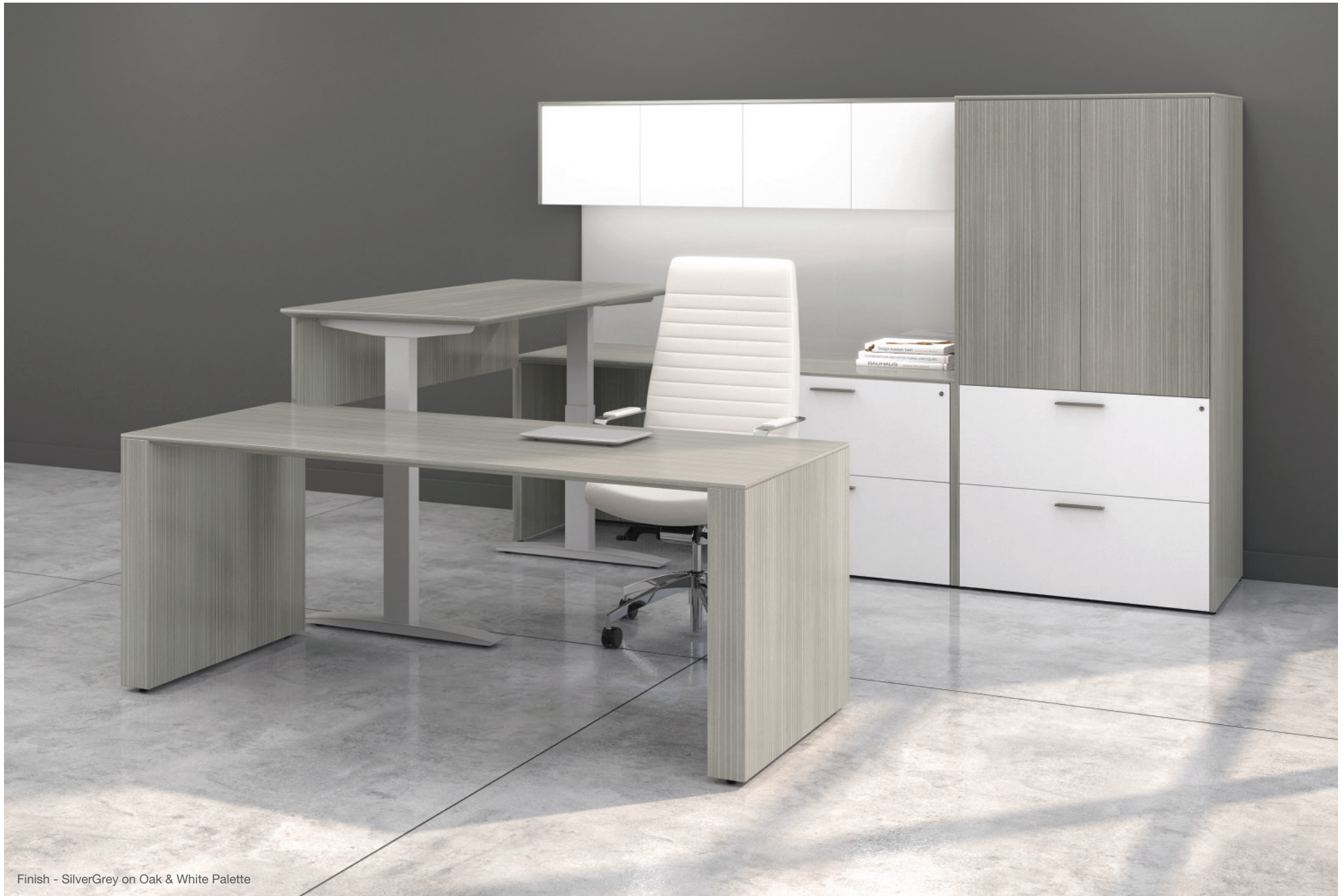
Finish - SilverGrey on Oak & White Palette