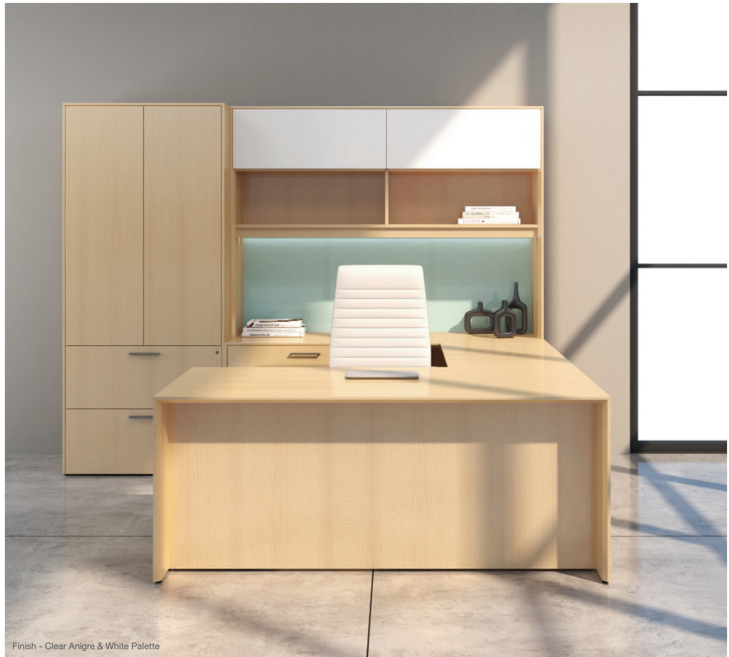
Finish - Clear Anigre & White Palette

Latitude offers hutch and overhead solutions in a variety of styles for use in a work area configuration. All hutches and overheads include L.E.D. tasklights mounted beneath the cabinet and hidden from view.