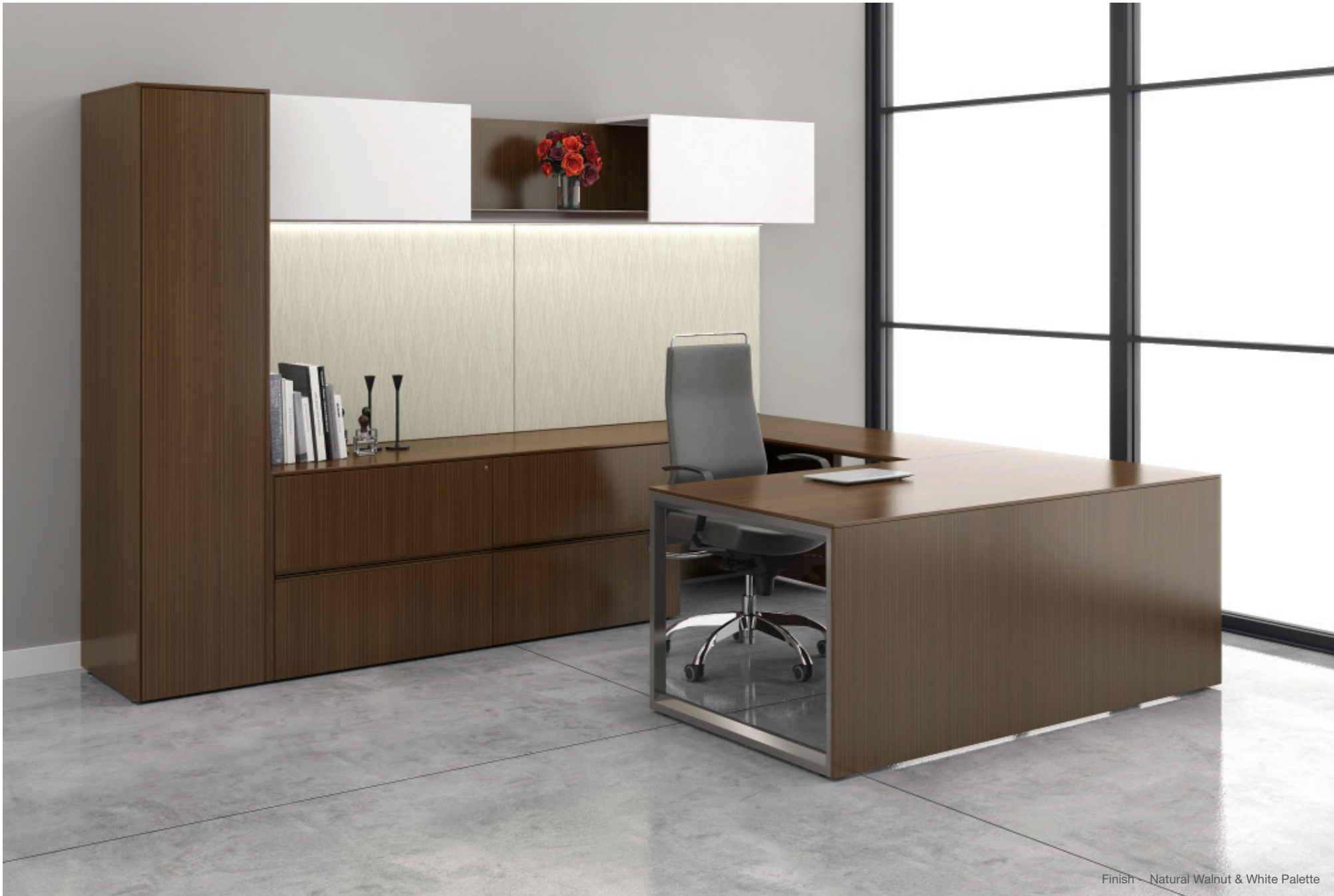
Finish – Natural Walnut & White Palette