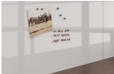
Back-painted glass panel