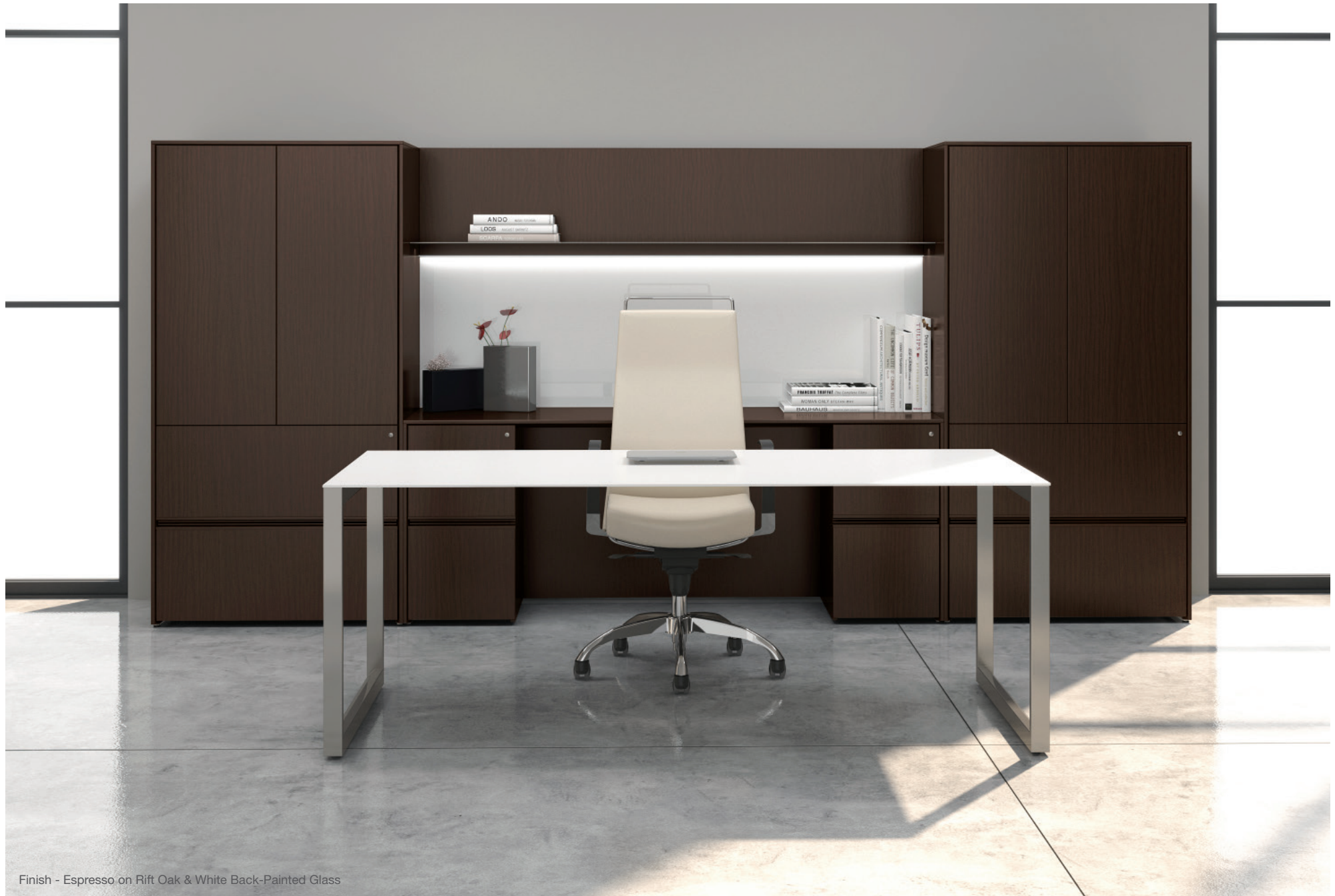
Finish - Espresso on Rift Oak & White Back-Painted Glass