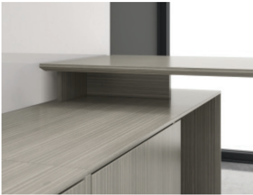
RUNOFF CORNER DETAIL