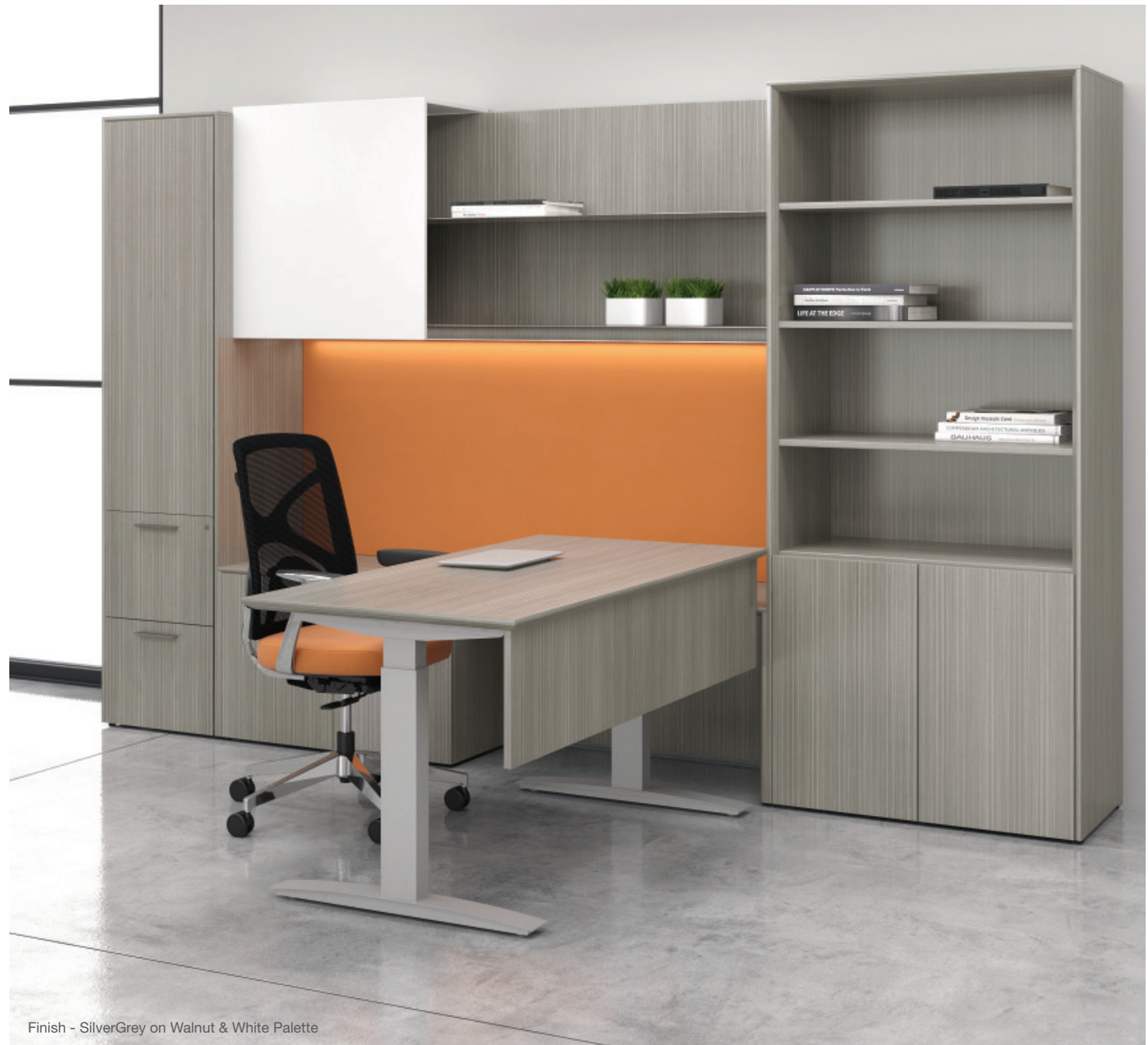
Finish - SilverGrey on Walnut & White Palette

Latitude's worksurface tops and drawers both have a beveled edge allowing the two to meet at a unique 45° miter.