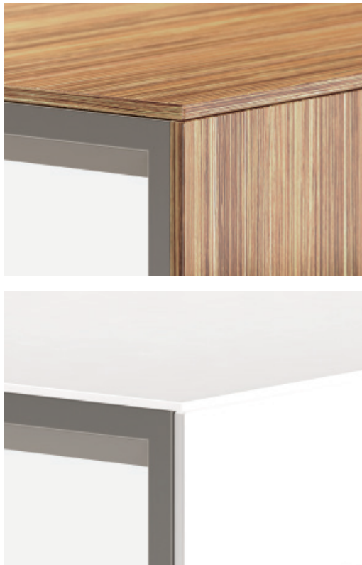
Finish - Clear Zebrawood, White Back-Painted Glass & White Palette