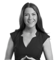
How to Lead Change Without Resistance or Resentment Course #4 / 11 Chapters