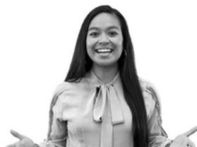
Six Ways to Make a Lasting Impression Course #2 / 7 Chapters