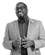
How to Develop and Maintain Others' Trust Course #3 / 13 Chapters