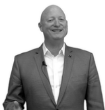
Essentials of Engagement Course #1 / 5 Chapters

The full program is over 2.5 hours in length, 36 total videos and is composed of four sections.