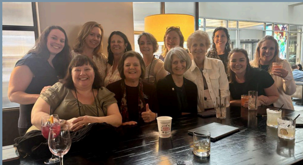
VT/NH APAN Members in Dallas