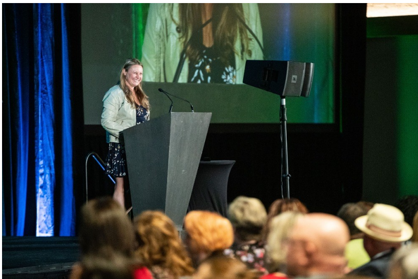
Chanda welcoming everyone to the National Conference at opening Ceremonies.