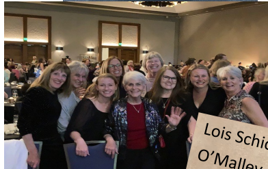
RMPANA at the President's reception