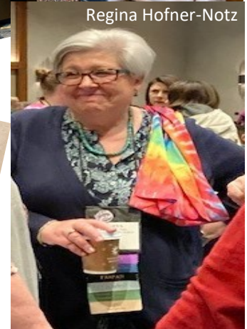
Below-RMPANA represented at the ABPANC luncheon.