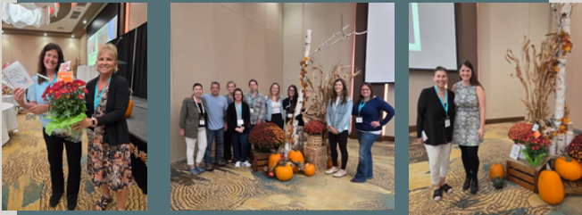
Thank you to everyone who submitted a basket. Congratulations to all the winners!

On October 4th and 5th, 2025, we were thrilled to welcome so many dedicated professionals to the Annual Fall Conference in Waite Park, MN, hosted by MNSGNA. Attendees earned 12.25 CNE credits for their participation in the enriching two-day conference. We covered a wide range of topics, including IBD, endobronchial valves, eosinophilic esophagitis, pancreatic cysts, cancer diagnosis, and the use of CO2 in endoscopy. It was wonderful to connect with colleagues during the evening networking events, where GI nurses and techs had the opportunity to socialize and share insights.