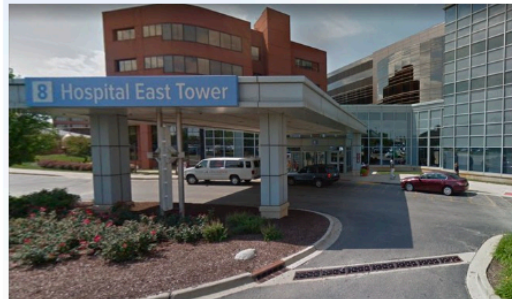
Ascension Alexian Brothers 800 Biesterfield Rd, Elk Grove Village, IL 60007

You will learn during class how to focus your study and improve your areas of opportunity. I recommend you schedule your exam the month following The CNOR Prep and Review Course.