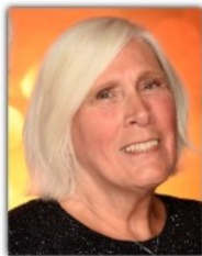
Regional Director Region Two