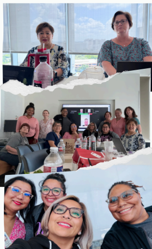
Board Strategic Planning Meeting June 2024

Keep watch on Nursing Network , Facebook and your emails for events and updates!