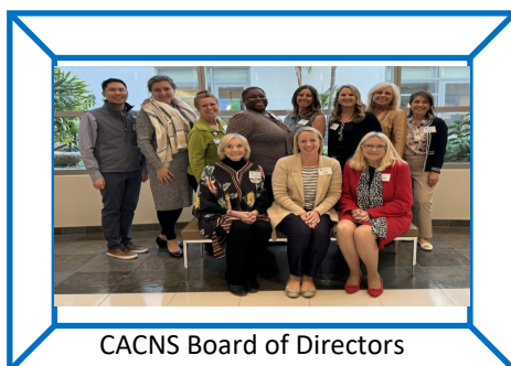
CACNS Board of Directors

Are you ready for a change? Do you want to expand opportunities professionally? Maybe you would like to network and learn from experts? All of this is possible through the California Association of Clinical Nurse Specialists, contact me to get started: president@cacns.org ;