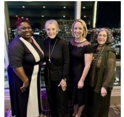
New Fellows to CNSI 2024 March NACNS, New Orleans

NACNS Institute Fellows: We welcomed 4 new CNSI fellows from California this year. Interested? We'll show you how to expand professionally through fellowship certification.