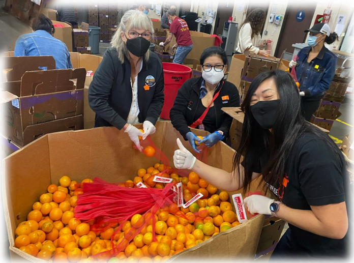
Packing oranges at the Los Angeles Food Bank