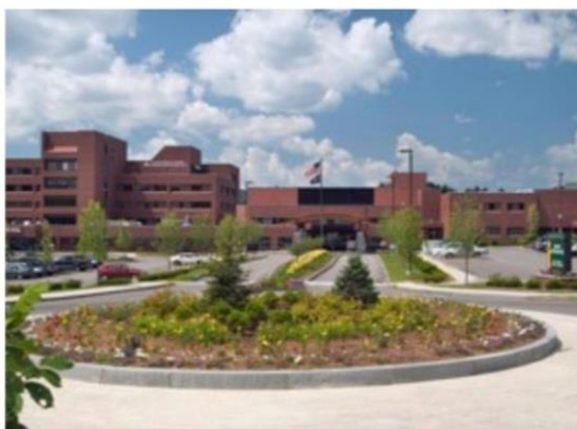
Cheshire Medical Center 580-590 Court Street Keene, NH 03431

You will learn during class how to focus your study and improve your areas of opportunity. I recommend you schedule your exam the month following The CNOR Prep and Review Course.