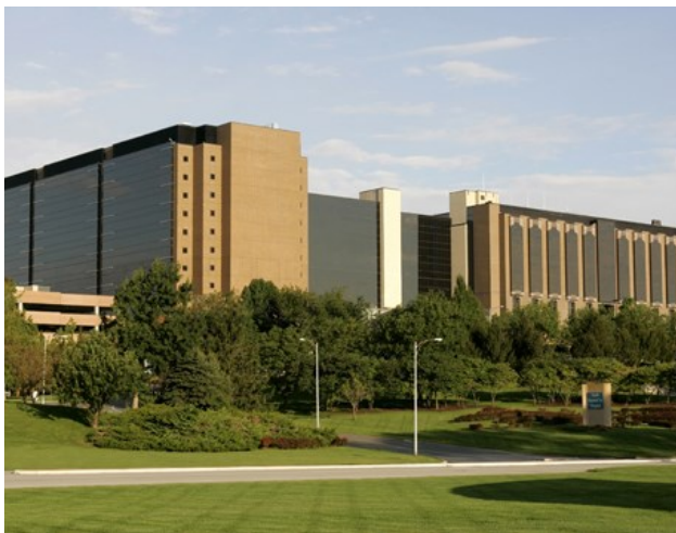
Prairie View Teleconference Room NKCH Health Services Pavilion 2790 Clay Edwards Drive North Kansas City, MO 64116

You will learn during class how to focus your study and improve your areas of opportunity. I recommend you schedule your exam the month following The CNOR Prep and Review Course.