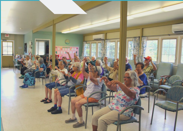
ADULT DAY CARE & RESPITE CARE

INDEPENDENT LIVING ASSISTED LIVING NURSING CARE ACUTE CARE HOSPICE