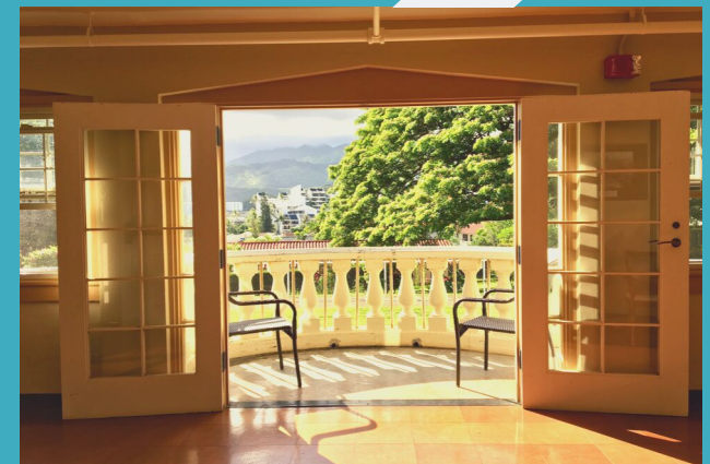
ACUTE CARE & HOSPICE

We provide a continuum of care for your loved one