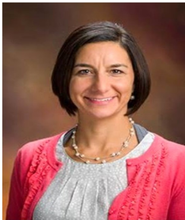
Concussion Care for Kids: Minds Matter Trauma/Concussion Program Orthopedic Surgery Children's Hospital of Philadelphia The Untold Foundation, Director of Education American Academy of Pediatrics, Pediatric mTBI ECHO Consultant