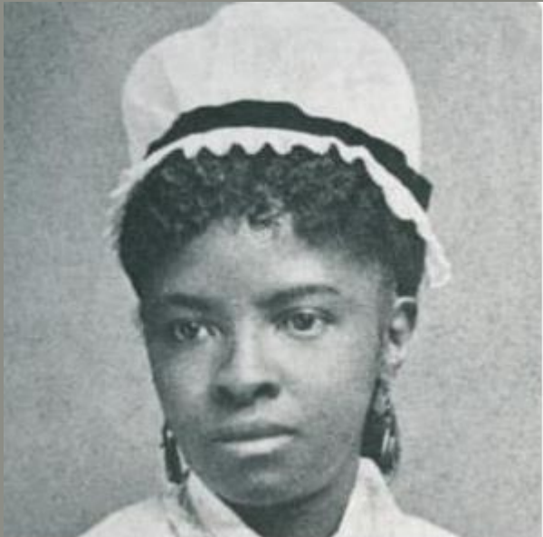
Mary Mahoney, first black nurse to graduate from Boston, co- founder of National Association of Colored Graduate Nurse