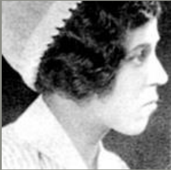
Martha Franklin, graduated from nursing school in Philadelphia, co-founder of National Association of Colored Graduate Nurses.