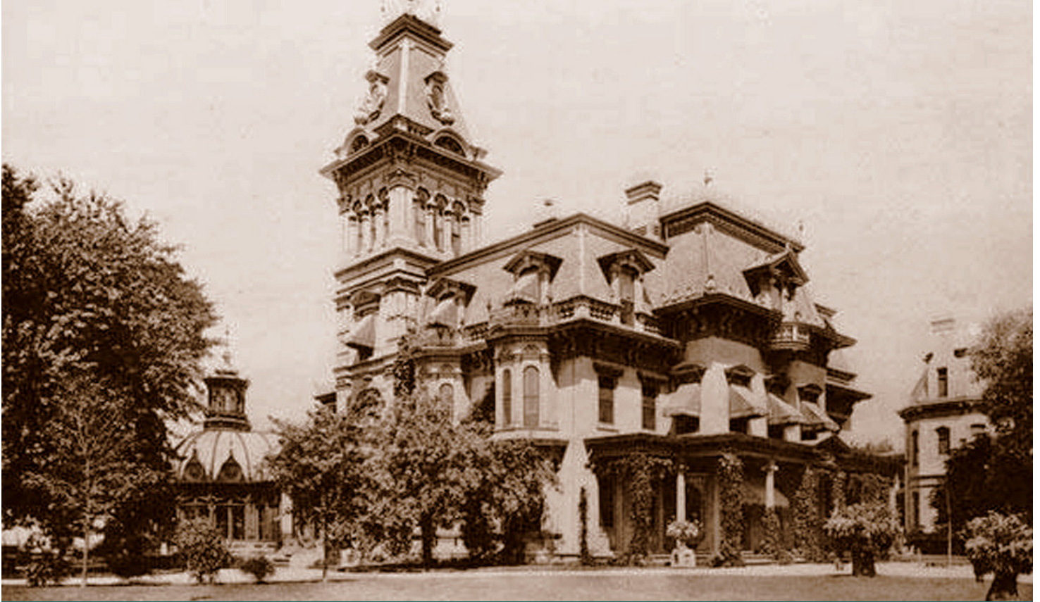
The Wisconsin Club's City Club - Established 1891