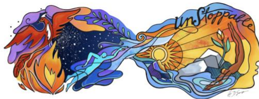
Unstoppable: AACN's 2019-2020 Theme