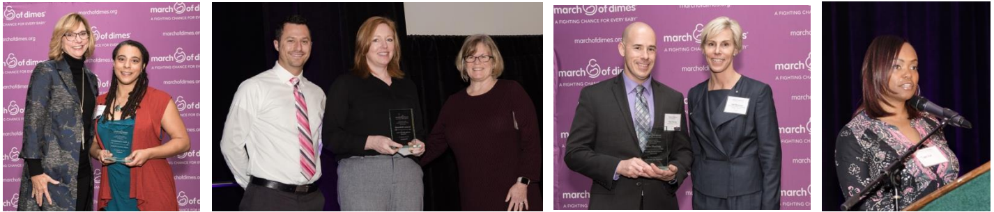
Images from the 2017 Washington Nurse of the Year event.

Nurses are first nominated by peers, nurse managers, supervisors or even the families they have impacted. Following, each nurse is asked to submit an application to be considered. Each application is carefully reviewed and scored by a committee of Chief Nursing Officers and other nurse leaders from the health care community until three finalists are narrowed down. Winners are announced at the event!