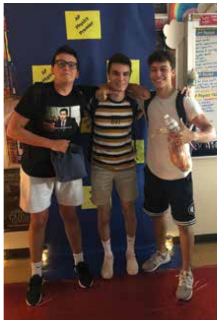
Arriving to physics class on the first day of school and being welcomed by a red carpet greeting and photo op.

I want my students thinking, thinking, thinking. The 5E learning cycle is the basis for creating my lessons. So, I try to provide them with hands-on ex-