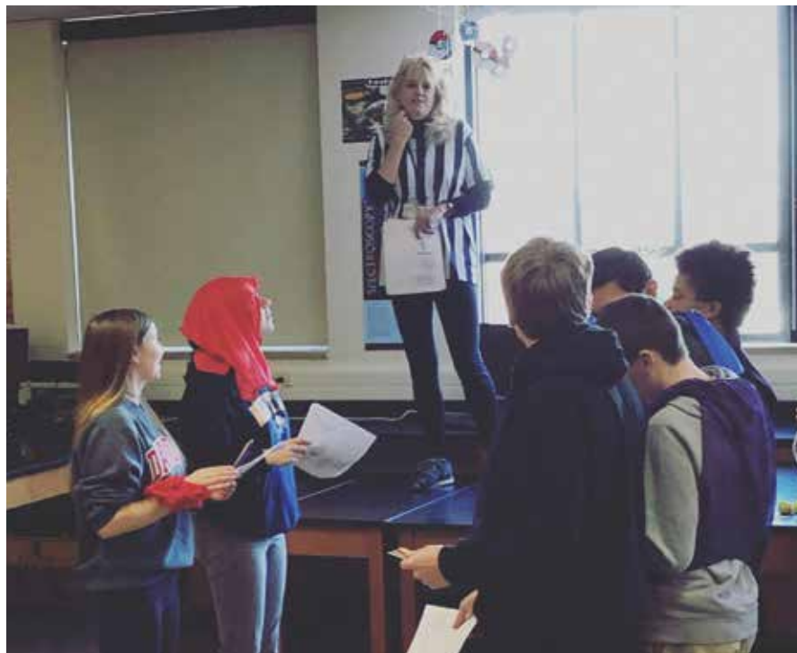
Students review for a final exam by working with partners in a football game simulation.

I debated becoming recertified when I reached the end of my first certification. My state no longer offered any assistance with the application fee, nor was there any stipend associated with certification. At the time, I was working as a facilitator of online mentors for