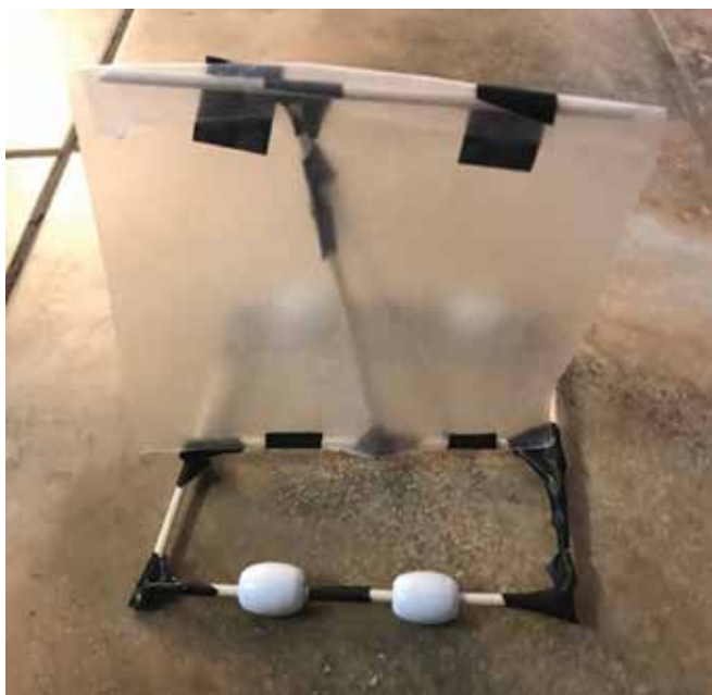
Sample student sail car.

lots of zeros, and today there are not.” Another student said, “The farthest one from yesterday was only 131 cm and today was 258 cm.” Students then created a line plot for their science notebooks representing data from the Explore and Elaborate phases for their sail car. Small stickers in blue and red were used to mark distances traveled by the two designs. Even though there was variation in the data for trials, patterns for the designs were still evident. When discussing the data, we would hold up a line plot in a student’s notebook and ask students to interpret it. Students were able to accurately summarize the relevant patterns in their own data and the data of their peers. Students’ individual line plots were used as a third formative assessment to determine if students could accurately graph their data on a number line.